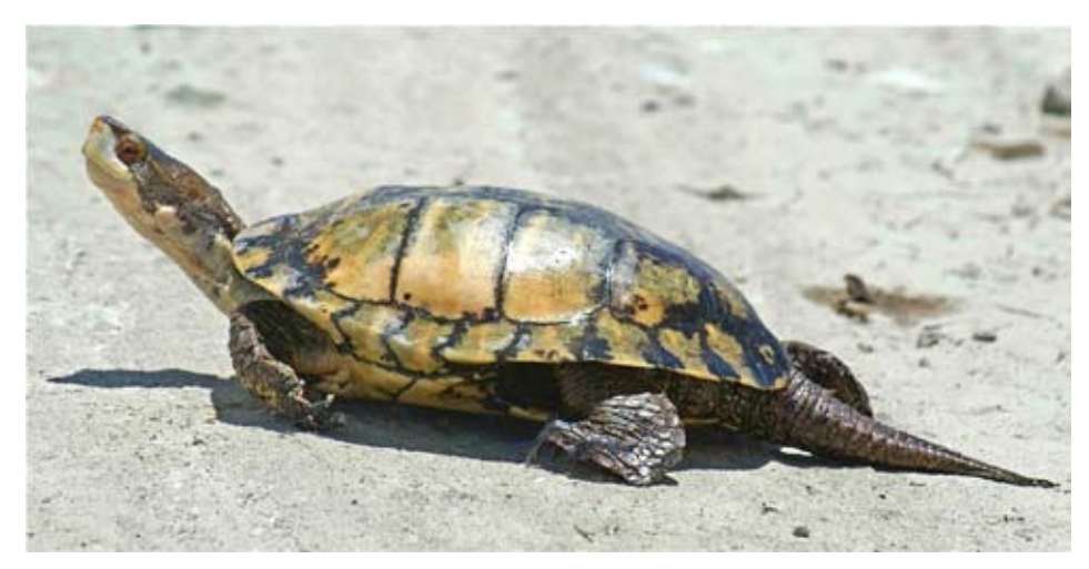
Figure 2. Adult male Actinemys marmorata from Fresno, San Joaquin Valley, California, USA.

Taxonomy. — The phylogenetic relationships of the western pond turtle, Actinemys marmorata , are in a state of flux. Recent evidence suggests that the species is distinct from the other three species of the former group Clemmys in eastern North America (Bickham et al. 1996; Feldman and Parham 2001; Holman and Fritz 2001). Feldman and Parham (2002) and Parham and Feldman (2002) presented evidence that the western pond turtle should be placed in the genus Emys , along with the European pond turtle ( Emys orbicularis ) and the Blanding's turtle ( Emys [= Emydoidea ] blandingii ), and this view has been adopted by others (Spinks et al. 2003; Spinks and Shaffer 2005). In contrast, Holman and Fritz (2001) and Stephens and Wiens (2003) believed that the western pond turtle is not closely related