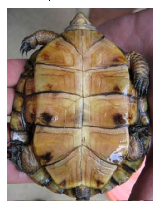
Figure 4. Juvenile Actinemys marmorata showing growth rings; from Klamath Lake region, southern Oregon, USA.

Description. — Male A. marmorata can be distinguished from females usually by a size of 120 mm carapace length (in some populations by 110 mm), when individuals are considered adults. Generally, adults range in size from 140-190 mm CL (Bury 1995; Lubcke and Wilson 2007). Hatchlings are 20–30 mm CL (Storer 1930; Feldman 1982; Lovich and Meyer 2002). Shell metrics appear to be related to geographic location, water temperatures and, perhaps, diet (Lubcke and Wilson 2007). The shell is low and broad, generally widest posterior to the middle (across the 8th marginal). Turtles in cool flowing waters, such as streams, may be more elongate than those living in standing waters, such as ponds and lakes (Lubcke and Wilson 2007). The carapace in adults is smooth and lacks a keel or serrations. Vertebral scutes are broader than long, and the first touches four marginals and the nuchal (Carr 1952; Ernst et al. 1994). The hind foot is webbed to the base of the claws (Ernst et al. 1994). The carapace coloration is usually dark brown or dull yellow-olive, with or without darker streaks or vermiculations. Many males in the Central Valley of California develop distinct yellow coloring on all or part of each marginal and costal scutes of the carapace (Fig. 2). The plastron is cream or light-yellow in color, sometimes with dark areas on parts of the scutes.