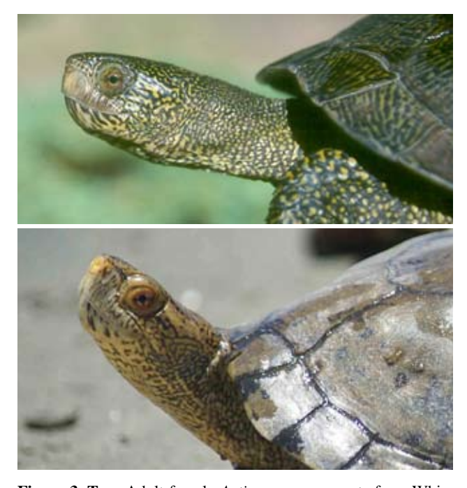
Figure 3. Top: Adult female Actinemys marmorata from Whiskeytown National Recreation Area, Shasta Co., California, USA. Bottom: Adult female A. marmorata from Fresno, San Joaquin Valley, California, USA.

Taxonomy. — The phylogenetic relationships of the western pond turtle, Actinemys marmorata , are in a state of flux. Recent evidence suggests that the species is distinct from the other three species of the former group Clemmys in eastern North America (Bickham et al. 1996; Feldman and Parham 2001; Holman and Fritz 2001). Feldman and Parham (2002) and Parham and Feldman (2002) presented evidence that the western pond turtle should be placed in the genus Emys , along with the European pond turtle ( Emys orbicularis ) and the Blanding's turtle ( Emys [= Emydoidea ] blandingii ), and this view has been adopted by others (Spinks et al. 2003; Spinks and Shaffer 2005). In contrast, Holman and Fritz (2001) and Stephens and Wiens (2003) believed that the western pond turtle is not closely related