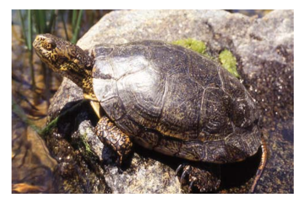
Figure 1. Adult female Actinemys marmorata from San Mateo Creek, Camp Pendleton, San Diego Co., California, USA.

STATUS. – IUCN 2007 Red List: Vulnerable (VU A1cd) (assessed 1996, needs updating); CITES: Not Listed; US ESA: Not Listed.