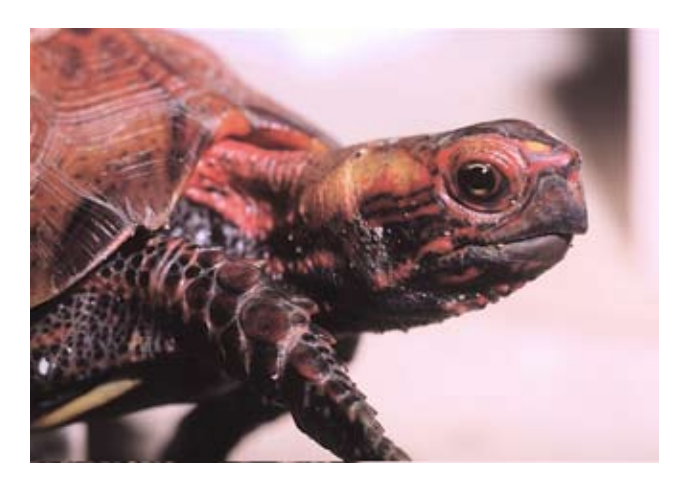
Figure 3. Adult male Geoemyda japonica from Okinawajima, Ryukyu Archipelago, Japan.