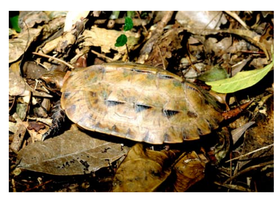
Figure 1. Adult male Geoemyda japonica from Okinawajima, Ryukyu Archipelago, Japan.