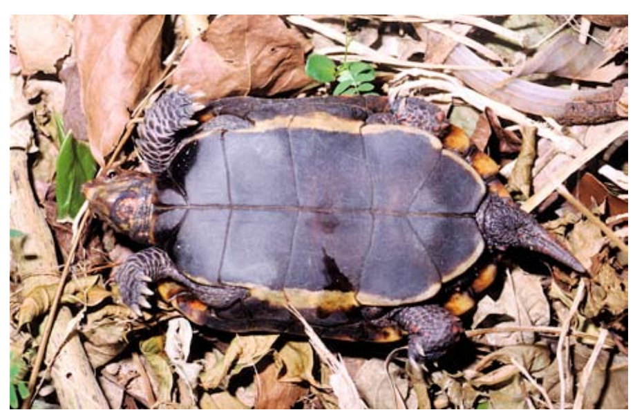
Figure 2. Adult female Geoemyda japonica from Okinawajima, Ryukyu Archipelago, Japan.

half a century later, Yasukawa et al. (1992) made detailed morphological comparisons between the two forms, and demonstrated that, besides the axillary scute condition and plastral formula, there are numerous additional characters that show considerable differences between them. Based on these results, Yasukawa et al. (1992) redescribed the Ryukyu black-breasted leaf turtle as a separate species, G. japonica .