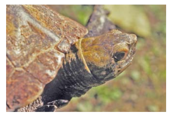
Figure 3. Adult female Mauremys japonica from Kyoto, western Honshu, Japan.

Description. - The Japanese pond turtle is a moderate-sized species among the family Geoemydidae, and its carapace length (CL) reaches about 200 mm. The CL of hatchlings ranges from 30-35 mm. The carapace is oval, relatively depressed, with a low medial keel. The posterior margin of the carapace is strongly serrated in juveniles. The serration becomes weaker with growth, but is still recognizable in adults. The bridge is wide with relatively large axillary and inguinal scutes. The plastron is large, elongate, and hingeless, with shallow anterior and deep posterior notches. The plastral formula is Ab >< F >< P > G >< An >< H in most animals. The entoplastron is intersected by gular-humeral and humeral-pectoral seams. The anterior hexagonal neurals are usually broadest anteriorly. The plastral buttresses are well developed, and firmly connected to the carapace. The bony connection