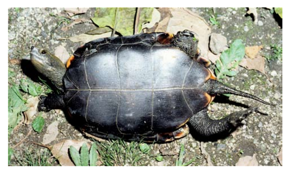
Figure 2. Adult female Mauremys japonica from Shiga, central Honshu, Japan.