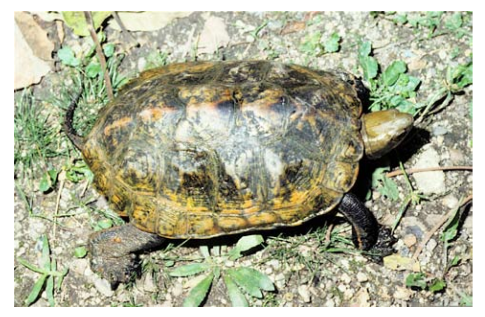
Figure 1. Adult female Mauremys japonica from Shiga, central Honshu, Japan. Photo by Yuichirou Yasukawa.

the genus. Recent molecular phylogenetic analyses have invariably showed very close affinity of the genus Mauremys , M. japonica in particular, with species of the genera Chinemys and Ocadia (Wu et al. 1999; McCord et al. 2000; Honda et al. 2002a; Barth et al. 2004; Sasaki