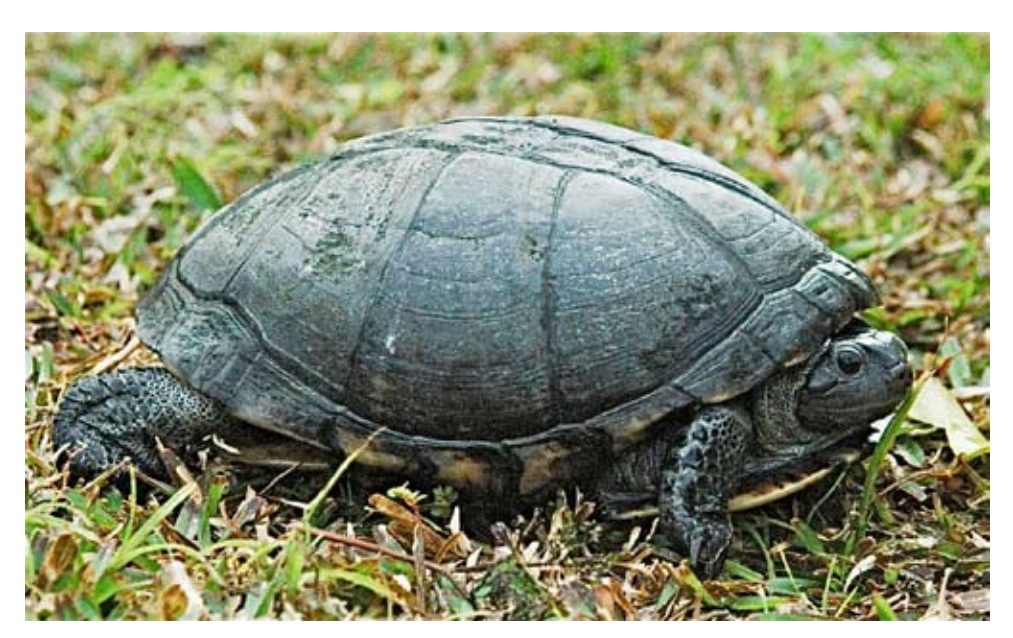
Figure 1. Pelusios subniger parietalis: an adult from the Seychelles.

Females have a rounded anal notch. The notch in males is straight-sided, male plastra may be slightly concave. Differences in anal notch shape are marginal and difficult to