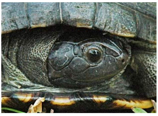
Figure 3. Pelusios subniger parietalis : head of an adult from the Seychelles.

by the elongated triangle of parietal scales reaching to the postoculars.