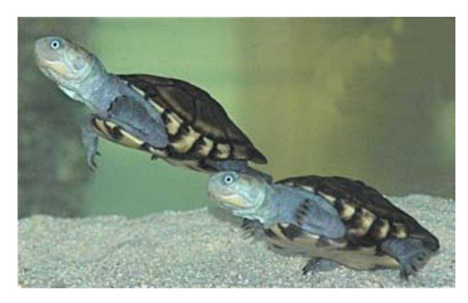
Figure 4. Pelusios subniger parietalis: hatchlings bred in captivity in the Seychelles.

No significant geographical variation has been detected within the Seychelles population and no mtDNA variation has been found (S. Rocha et al., unpubl. data). The Seychelles subspecies is distinguished from the nominate subspecies