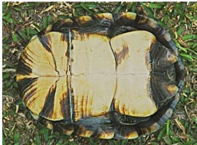
Figure 2. Pelusios subniger parietalis: carapace and plastron of an adult from the Seychelles.

discriminate. The maximum size is 200 mm curved carapace length for females and 158 mm for males (normal range 100–166mm).