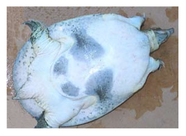
Figure 2. Apalone spinifera atra from Tío Cándido, Cuatrociénegas Basin, Coahuila, Mexico.

Description . — The black spiny softshell is a mediumsized aquatic turtle reaching 282 mm in carapace length. The ovoid carapace is low with fine longitudinal corrugations along the posterior border (often ragged or notched) and