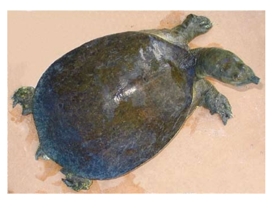
Figure 1. Apalone spinifera atra from Tío Cándido, Cuatrociénegas Basin, Coahuila, Mexico.

and Rio Cañon) which contained A. s. emoryi and A. s. atra intermediate morphs.