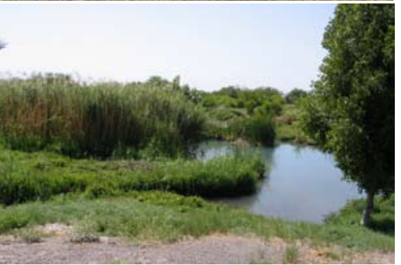
Figure 5. Habitat of Apalone spinifera atra in Cuatrociénegas Basin. Top: Poza del Tío Cándido, type locality. Bottom: Anteojo.

interspecific matings between atra and emoryi at some localities. Winokur (1968) confirmed the existence of intermediates, but he concluded that hybridization was restricted and that atra was keeping its genetic integrity as a full species.