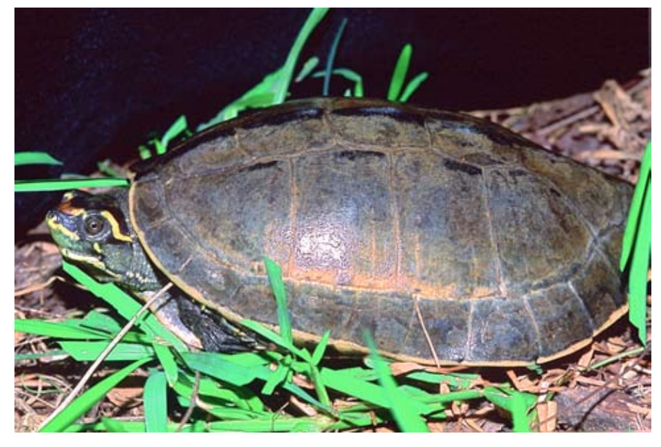
Figure 1. Hardella thurjii; adult male. National Chambal Sanctuary, Madhya Pradesh, India.

(1885, 1886) placed the species in the genus Batagur , in his monographs on the fossil turtles of India. All authors have, however, continued to recognize Hardella as a distinct genus for this species. Synonyms include Emys flavonigra