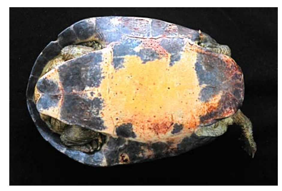
Figure 2. Hardella thurjii; adult female. Shella, Cherrapunji, Meghalaya, India.

Lesson 1831, Kachuga oldhami Gray 1869, Batagur floweri Lydekker 1885, Batagur cautleyi Lydekker 1885, and Batagur watsonii Lydekker 1886.