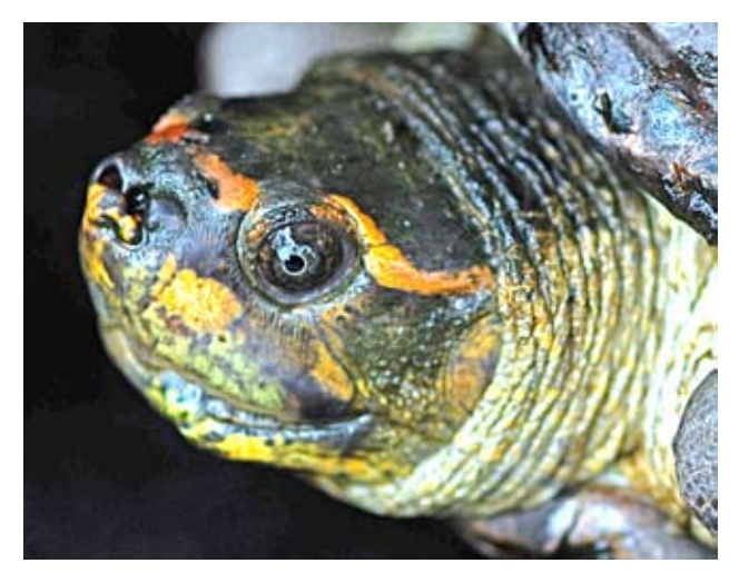
Figure 3. Hardella thurjii ; adult female portrait. Shella, Cherrapunji, Meghalaya, India.

A Plio-Pleistocene turtle from the Siwaliks of Haritalyanagar, Himachal Pradesh, Geoemyda pilgrimi Prasad and