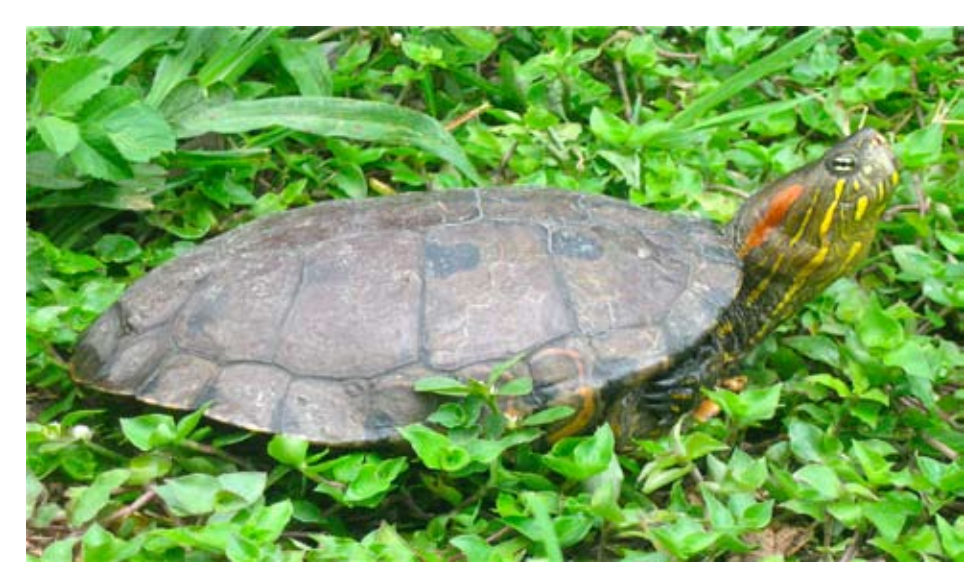
Figure 1. Trachemys callirostris callirostris, adult female from Colombia.

sister taxon to T. callirostris , and molecular data appear to corroborate this hypothesis (Jackson et al. 2008).