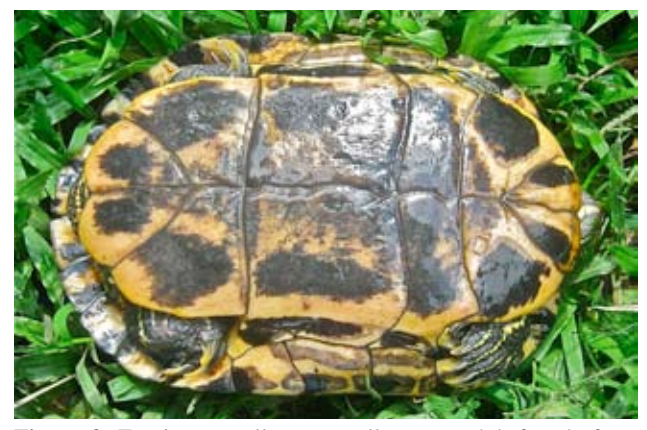
Figure 3. Trachemys callirostris callirostris , adult female from Colombia, showing plastral markings, same animal as Fig. 1.

cm carapace length (CL) or 5 kg in mass. The oval carapace is widest at the junction of marginals VII and VIII and it is either domed or flattened with the highest point at the rear of vertebral III. There are five vertebral scutes, four pairs of costal scutes, and 12 pairs of marginal scutes that have a smooth outer edge. The plastron is large, broad, and flat with a posterior notch. The wide bridge may be equivalent to as much as 40% of the total CL. The large rounded head has a slightly conical snout and is flat or slightly concave dorsally. There is sexual size dimorphism (Medem 1975; Sampedro-M. et al. 2003), with females being larger than males and having broader heads, higher carapaces, and thinner, shorter tails (but forelimb claws are not dimorphic, as in some other Trachemys species). Females also appear