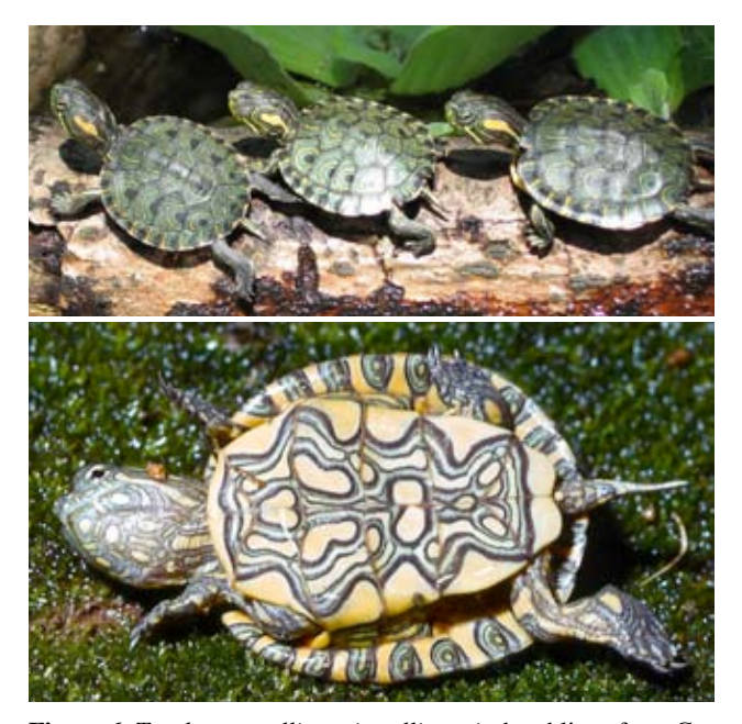
Figure 6. Trachemys callirostris callirostris , hatchlings from Colombia.

Hatchlings emerge measuring approximately 30 mm CL and 6.5 g in mass (Correa-H. 2006; Restrepo et al. 2007). Their carapaces are bright green with a pronounced black spot