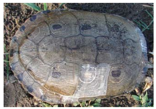
Figure 2. Trachemys callirostris callirostris , adult female shell from Colombia, showing carapacial markings.

Description. — The most complete description of the two subspecies of T. callirostris can be found in Pritchard and Trebbau (1984) and is summarized here. Adult T. callirostris are moderately sized sliders not known to exceed 33