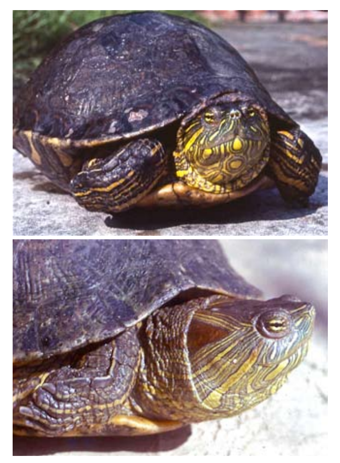
Figure 7. Trachemys callirostris chichiriviche , adult females from central coastal Venezuela. Note the diagnostic lack of maxillary ocelli and the presence of a wedge-shaped brownish-red post-orbital stripe.

described the subspecies was principally for local domestic consumption, while most of our T. c. callirostris populations currently experience heavy commercial exploitation. Even so, we have documented a female T. c. callirostris of 31.5 cm CL (Daza 2004), well into the range reported for T. c. chichiriviche . Medem (1975) also reported female T. c. callirostris attaining 30 cm CL. When more size data for T. c. chichiriviche become available, it may well result that there is indeed a statistically significant difference in the size distributions for the two subspecies, but it will surely be more subtle than initially reported, and may be simply the result of the two subspecies occupying different habitats or experiencing different levels of exploitation.