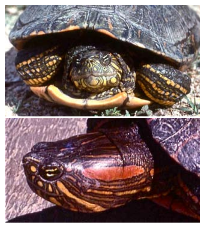
Figure 4. Trachemys callirostris callirostris , adult females from Colombia.

cm carapace length (CL) or 5 kg in mass. The oval carapace is widest at the junction of marginals VII and VIII and it is either domed or flattened with the highest point at the rear of vertebral III. There are five vertebral scutes, four pairs of costal scutes, and 12 pairs of marginal scutes that have a smooth outer edge. The plastron is large, broad, and flat with a posterior notch. The wide bridge may be equivalent to as much as 40% of the total CL. The large rounded head has a slightly conical snout and is flat or slightly concave dorsally. There is sexual size dimorphism (Medem 1975; Sampedro-M. et al. 2003), with females being larger than males and having broader heads, higher carapaces, and thinner, shorter tails (but forelimb claws are not dimorphic, as in some other Trachemys species). Females also appear