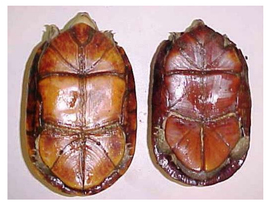
Figure 2. Adult female (left) and male (right) K. scorpioides albogulare from San Andrés Island, Colombia.

can be phenotypic intermediates between albogulare and cruentatum along the Pacific Coast in southern Guatemala and El Salvador. Apparently, there has been confusion regarding the identification of some individuals from Honduras, classified as K. s. cruentatum (Red-cheeked Mud Turtle) because individuals of K. s. albogulare can also have red markings on their heads (Iverson 2010).