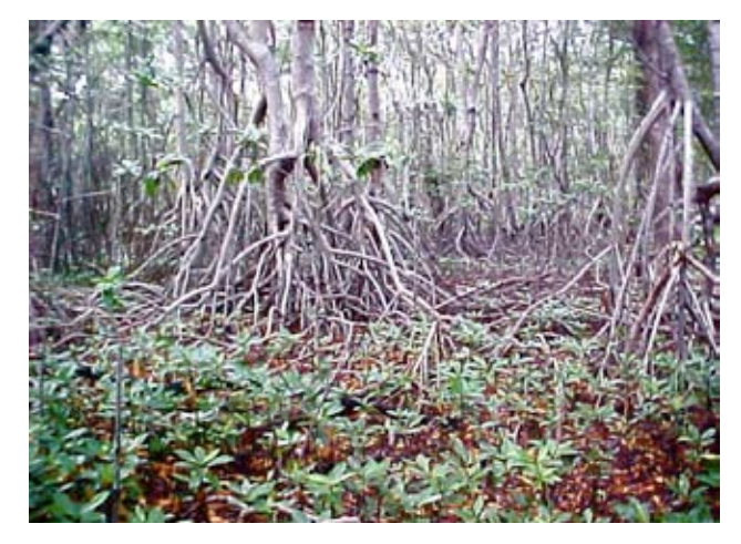
Figure 3. Mangrove swamp habitat of K. scorpioides albogulare on San Andrés Island, Colombia.

Distribution. — Kinosternon s. albogulare occurs from western Honduras and El Salvador, through Nicaragua, Costa Rica, and western Panama, as well as the Colombian island of San Andrés in the Caribbean (Ernst and Barbour 1989). It is not known when the species arrived on this island from the mainland. Although Dunn and Saxe (1950) suggested it might have arrived recently because of no recognizable differences with mainland populations,