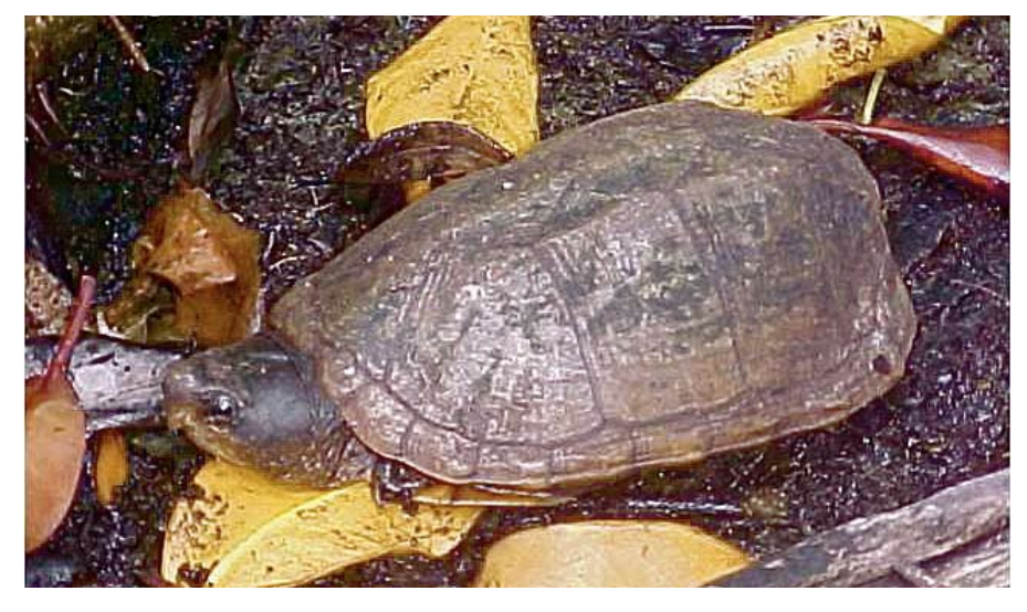
Figure 1. Adult Kinosternon scorpioides albogulare in a mangrove forest, San Andrés Island, Colombia.

albogulare , referring to the San Andrés (Colombian island in the Caribbean) population and its similar type in Central America. There are three other subspecies currently recognized for K. scorpioides : K. s. scorpioides , K. s. abaxillare , and K. s. cruentatum (Cabrera and Colantonio 1997; Berry and Iverson 2001, 2011). According to Berry (1978), there