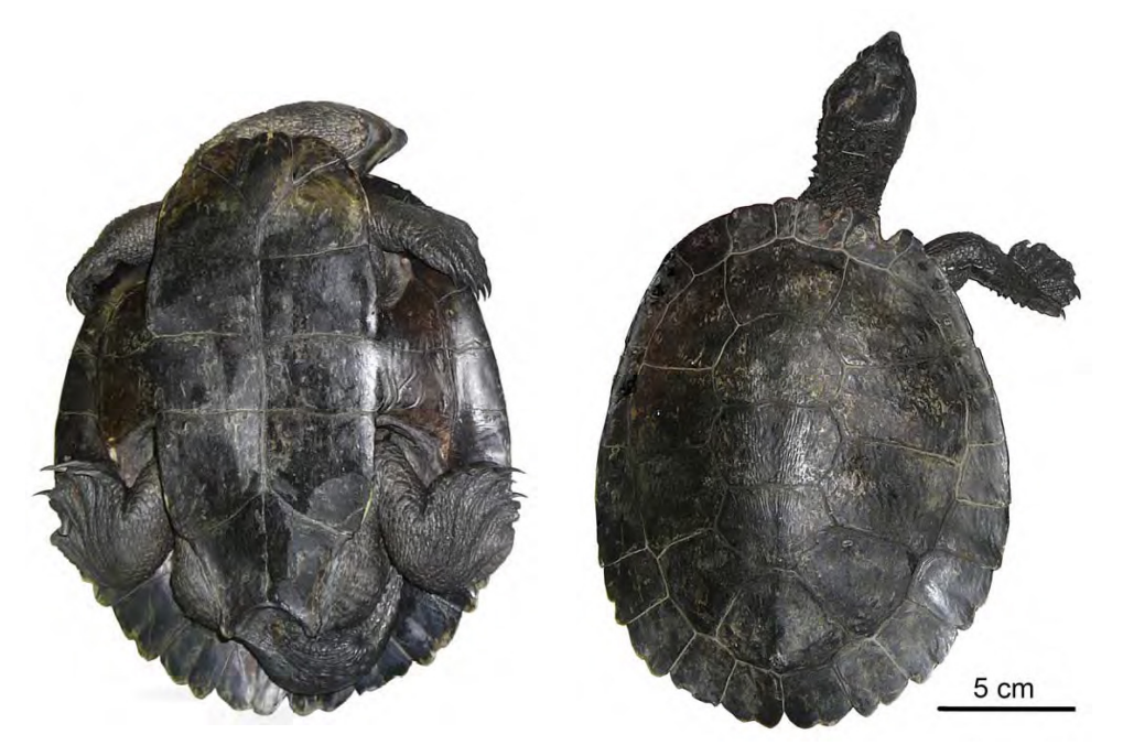
Figure 2. Ventral and dorsal views of male Myuchelys bellii from Bald Rock Creek, Border Rivers catchment, Queensland, Australia.

The generic name Wollumbinia was coined by Wells (2007) to include E. bellii , but appeared in an electronic document without peer review and is of disputed status with respect to the International Code of Zoological Nomenclature (ICZN 1999); we do not regard it as an available name. In any case, we follow the recommendations of Kaiser et al. (2013) and regard the Wells (2007) document as neither a scientific paper ( sensu CBE 1968) nor a publication for the purposes of nomenclature. Thomson and Georges (2009) instead placed E. bellii in the genus Myuchelys , which they separated from Elseya , a classification followed in the revision by