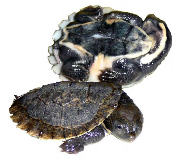
Figure 4. Ventral and dorsolateral views of a hatchling Myuchelys bellii from the Bald Rock Creek, Border Rivers catchment, Queensland, Australia.

Hatchlings almost circular in outline (mean carapace length 26.7 \pm 0.3 mm; mean carapace width 26.8 \pm 0.6 mm, n = 16), with moderate serration of the margins