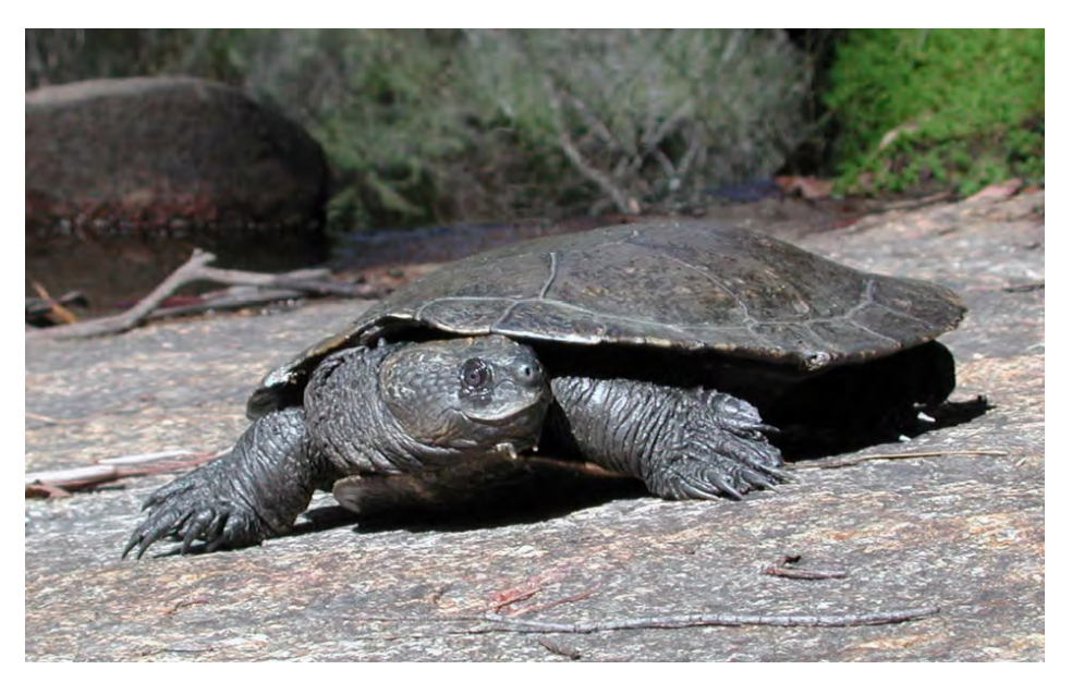
Figure 1. Adult female Myuchelys bellii from Bald Rock Creek, Border Rivers Catchment, Queensland, Australia.

Concurrently, investigative work by Rhodin (unpubl. data) clarified the identity and origin of the holotype of Phrynops bellii , and Cann (1998) provided circumstantial evidence that the type specimen was sourced from the Namoi and Gwydir river systems of Australia. Recent morphometric analyses have also supported Cann's (1998) match with the holotype specimen of Phrynops bellii (Fielder, 2013). The species was first transferred to the genus Elseya by Cann (1998), who also reported the occurrence of a population of similar turtles in Bald Rock Creek in the Queensland portion of the Border Rivers catchment, but was uncertain of its status.