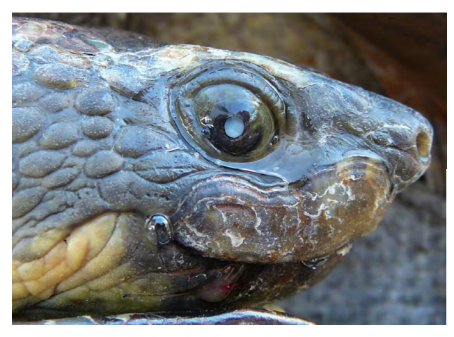
Figure 7. Myuchelys bellii is susceptible to eye diseases such as cataracts, which can lead to blindness.

Threats to Survival. — Myuchelys bellii has delayed age at first breeding, low annual fecundity, and high