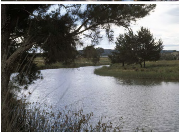
Figure 6. Typical habitat of Myuchelys bellii . Top : Bald Rock Creek, Border Rivers catchment, Queensland. Bottom : Roumalla Creek, Gwydir River catchment, New South Wales.

can last up to 15.5 days. The species is similar to Elseya albagula and Rheodytes leukops in its ability to use aquatic respiration to support prolonged submergences and dives, especially at lower water temperatures, and its crepuscular peaks in activity (Fielder 2012). Myuchelys bellii also hibernates in deep water (>3 m) as an overwintering strategy when ambient water temperatures drop to about 5°C during July (Fielder 2012). Basking occurs throughout the active months when animals emerge fully to bask on granite boulders or protruding logs (Fielder 2012).