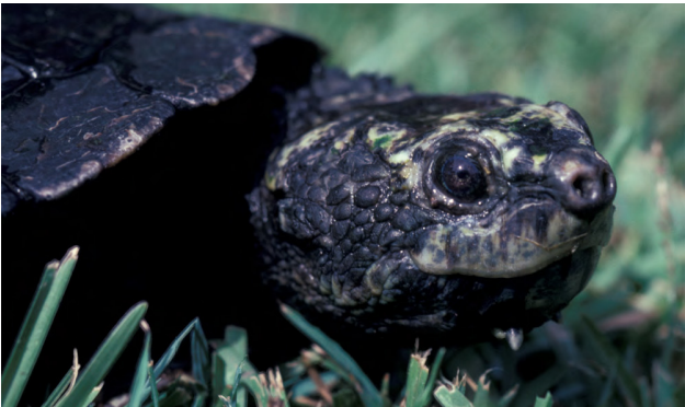
Figure 3. Lateral views of the heads of A : a young Myuchelys bellii and B: an aged individual, both from Roumalla Creek, Gwydir River catchment, New South Wales, Australia. Note the prominent and well-defined head shield with its projection down the parietal ridge toward the tympanum, the enlarged pointed tubercles on the neck and the low rounded tubercles on the temporal region.

Georges and Thomson (2010). Subsequent molecular and morphological assessments have found no substantive genetic (Fielder et al. 2012) or morphological (Fielder 2013) differences among populations from the Gwydir, Namoi, and Border Rivers catchments. They found little evidence to support any taxonomic subdivision of M. bellii at the species or subspecies level, as suggested by Cann (1998:208, 212). Myuchelys bellii and M. latisternum are sister taxa (Fielder et al. 2012; Le et al. 2013).