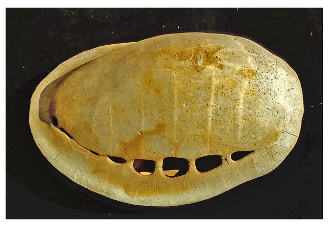
Figure 5. Carapace of male Batagur affinis (431 mm CL) showing costo-peripheral fontanelles.