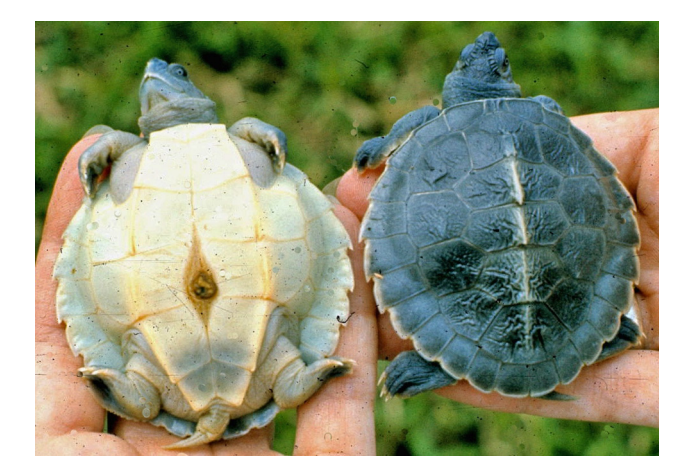
Figure 11. Batagur affinis affinis hatchlings from the Perak River, Malaysia.

west coast averaged 438 mm CL (400–502 mm, n = 76) and 488 mm CL (430–546 mm, n = 156), respectively. East coast terrapins ( B. a. edwardmolli ) averaged larger; females nesting on a Terengganu River beach (Moll, unpubl. data) averaged 552 mm CL (532–602 mm, n = 29), and a sample from the Dungun River (Chan, unpubl. data) averaged 537 mm CL (410–625 mm, n = 28). Based on Moll (1980), Gibbons and Lovich (1990) determined that female B. affinis were on average 11% larger than males in carapace length. Lovich et al. (2014) suggested that patterns of sexual size dimorphism among turtles are