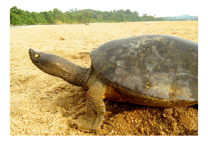
Figure 2. Male Batagur affinis edwardmolli (453 mm CL) from the Dungun River, Terengganu, eastern Malaysia.

River terrapins have relatively small heads with an upturned, somewhat attenuated snout. Batagur a. edwardmolli appears to have a narrower and sharper snout than B. a. affinis from the west coast of the Malay Peninsula, but this has not yet been quantified. The skin at the posterior end of the head is divided to form a number of irregularly-shaped scales. The upper jaw is bicuspid (a median notch flanked by pointed tooth-like projections).