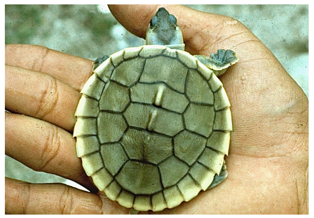
Figure 12. Hatchling Batagur affinis edwardmolli from the Terengganu River.