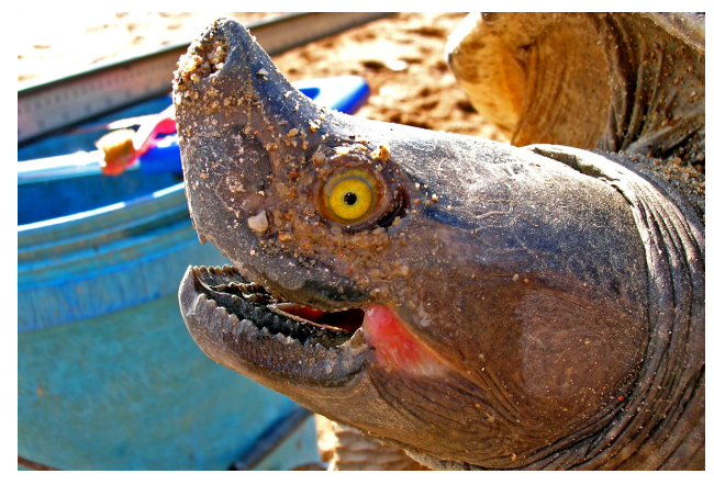
Figure 9. Male Batagur affinis edwardmolli from the Dungun River, eastern Malaysia, in June, after the breeding season.

Coloration varies geographically. River terrapins from the eastern coast of Malaysia ( B.a.edwardmolli ) are colored similarly except that females and juveniles have a silvery patch on the lateral side of the head behind the eyes. East coast hatchlings are also more colorful, having a bright silvery head patch and an olive to olive-brown carapace bordered