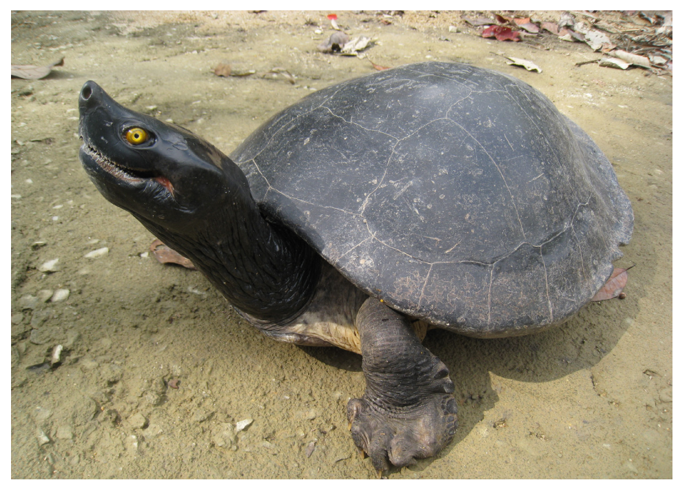
Figure 1. Adult male Batagur affinis edwardmolli from the Setiu River, Terengganu, eastern Malaysia, in breeding color.

However, the problem appeared still more complex, as coloration, morphology, and behavior of terrapin populations on the west and east coasts of Malaysia differed significantly (Moll 1980) with the latter bearing obvious resemblance to a relictual population in Cambodia. Praschag et al. (2009) assessed the taxonomic status of the Cambodian relict population using phylogenetic analyses of three mitochondrial and three nuclear DNA fragments and compared them to all other Batagur species. Genetically, Cambodian Batagur were found to be closely related but distinct from B. affinis from Sumatra and the west coast of the Malay Peninsula. Morphologically, Cambodian Batagur resemble the distinctive B. affinis populations from the eastern Malay Peninsula that were not available for genetic study. Consequently, Praschag et al. (2009) described the unnamed Batagur populations from the eastern Malay Peninsula and Cambodia as the new subspecies Batagur affinis edwardmolli that presumably once inhabited estuaries surrounding the Gulf of Thailand.