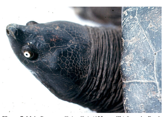
Figure 7. Male Batagur affinis affinis (455 mm CL) from the Perak River, western Malaysia, in breeding coloration. Note the irregularly shaped scales on the posterior head.

Like other members of the genus (except B. dhongoka ), Southern River Terrapin males are sexually and seasonally dichromatic. On the west coast, non-breeding males tend to be a dark olive-brown (somewhat darker than females in shell and skin coloration) and have a yellowish to creamcolored iris. Males in breeding condition have a strikingly white iris, a dark cornea, and a jet black head, neck, limbs, and carapace. Well before sexual maturity, the eyes of males tend to be lighter in color than those of females.