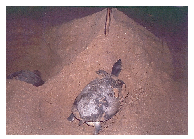
Figure 13. Batagur affinis affinis nesting at night in January 1976 at Bota Kanan on the Perak River, Perak, Malaysia. The hillock in the photo was built by the egg collector who felt it attracted the female turtles.

Distribution. — Batagur affinis affinis occurs along the western coast of West Malaysia and eastern Sumatra in Indonesia and into southernmost Thailand on the western Malaysian Peninsula. Batagur affinis edwardmolli is distributed along the eastern coast of West Malaysia and the Songkhla region of adjacent southernmost eastern peninsular Thailand bordering the South China Sea, and Cambodia, where a relict population survives in the Sre Ambel River system. Formerly it extended into the Mekong delta of Vietnam, with animals occurring upstream to Tonle Sap Lake in Cambodia. Additionally, archaeological turtle fragments from the lower Bang Pakaong River of southeastern Thailand have been identified as Batagur, suggesting that B. affinis