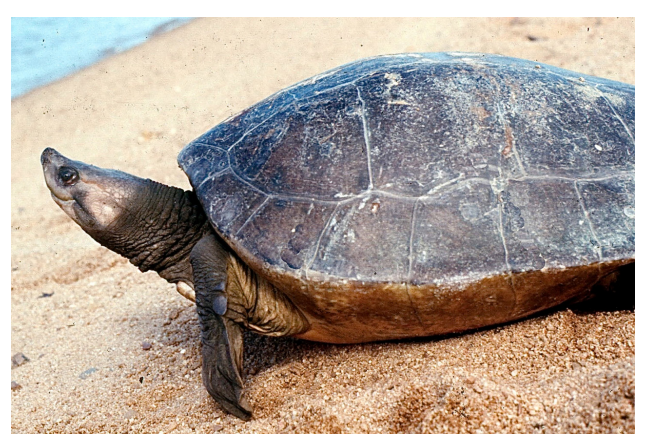
Figure 4. Adult female Batagur affinis edwardmolli (503 mm CL) from the Terengganu River.