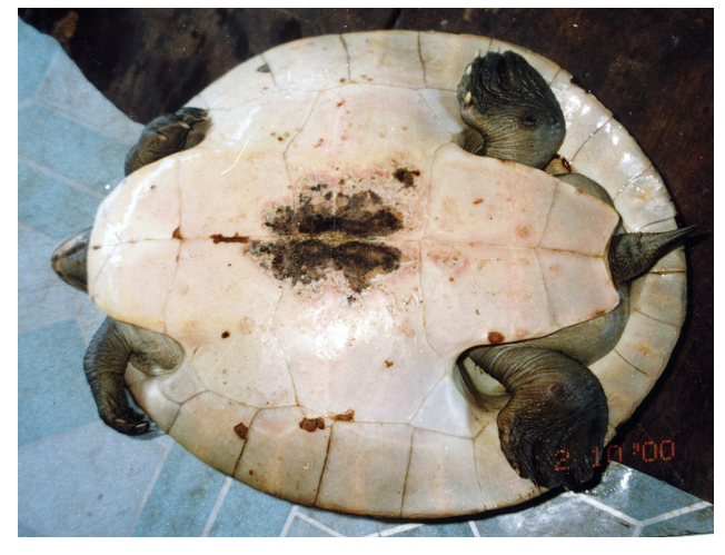
Figure 6. Subadult Batagur affinis edwardmolli from Sre Ambel, Cambodia.

scutes and bones comprising the shell fuse with age. Shells of old individuals become smooth and seamless.