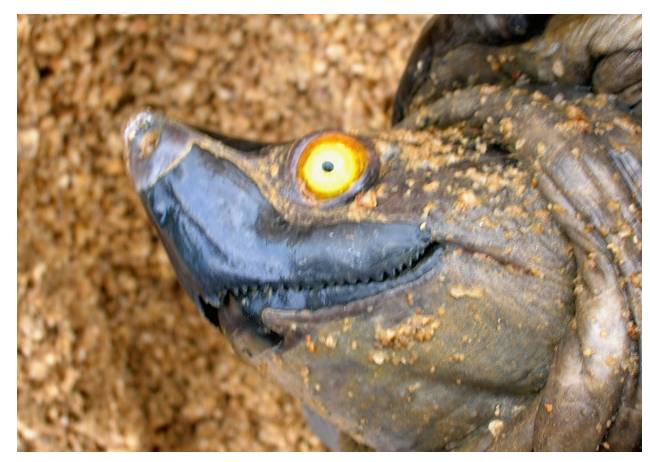
Figure 8. Male Batagur affinis edwardmolli from the Dungun River, eastern Malaysia, in April, slightly after the breeding season.