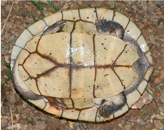
Figure 2. Record-sized adult female Chelodina mccordi (CL = 241 mm) from mid-central Roti near Danau Peto, May 2006; she laid a clutch of 9 eggs.