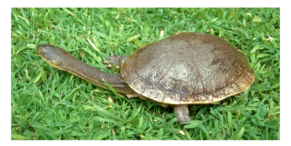
Figure 1. Adult male Chelodina mccordi (CL = 180 mm) from mid-central Roti Island, Indonesia, near Busalangga, April 1993.

STATUS. – IUCN 2007 Red List: Critically Endangered (CR A1d, B1+2e) (assessed 2000); CITES: Appendix II.