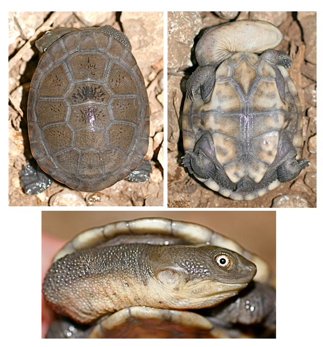
Figure 3. Small juvenile Chelodina mccordi (CL = 67 mm) from mid-central Roti near Danau Peto, May 2006.

Chelodina mccordi is geographically isolated from all other Chelodina species, and represents a relictual form endemic to the small island of Roti. Its biogeographic origin