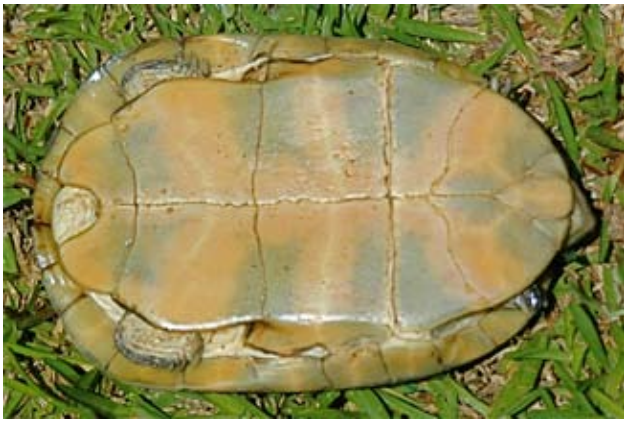
Figure 2. Pelusios castanoides intergularis : plastron of an adult from the Seychelles.

masseteric scales. The dorsal surface of the head is yellow with dark brown to black vermiculations. The anterior forelimb is partially covered with 4–6 falciform (i.e., sickle-shaped) scales. The neural bones form a complete series anteriorly. The skull has reduced tuberculae basioccipitale compared to the nominate subspecies.