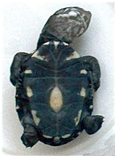
Figure 4. Pelusios castanoides intergularis : hatchling bred in captivity in the Seychelles.

No significant geographical variation has been detected within the Seychelles population and no mtDNA variation has