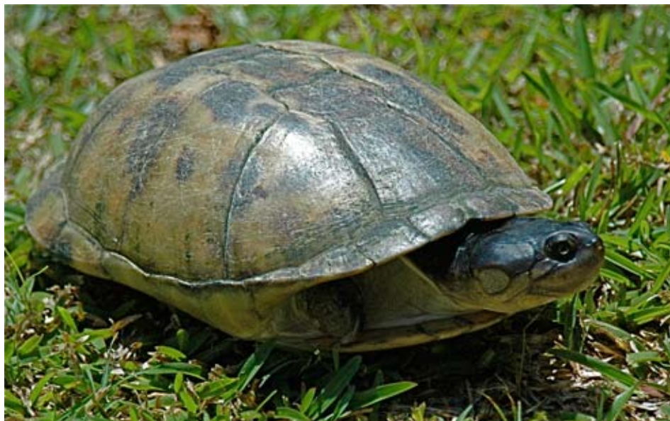
Figure 1. Pelusios castanoides intergularis : an adult from the Seychelles.

On the head the supralabial scale (between the postocular and the masseteric) is reduced; it may be absent or moderately large, and it does not completely separate the postocular