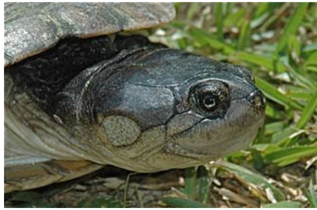
Figure 3. Pelusios castanoides intergularis : head of an adult from the Seychelles.

been found (S. Rocha et al., unpubl. data). The Seychelles subspecies is distinguished from the nominate subspecies by the narrow intergular with S-shaped lateral margins.