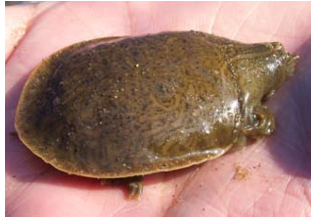
Figure 4. Chitra indica hatchling, Ganga River, Uttar Pradesh, India.

Adult males possess comparatively longer tails, with thicker bases, than females. In Bangladesh, females attain a greater average size than males. Rashid (1991) and Rashid and Swingland (1997) measured 21 males and the same number of females, dividing each group into “large” and “medium-sized” individuals that may have corresponded, at least roughly, to adult and subadult animals. The large males averaged 55.83 cm in CL (range 51–61.5 cm), 50.49 cm in carapace width (range 47–57 cm), and had an average mass of 17.3 kg (range 17–25.6 kg). The large females averaged 64.44 cm in CL (range 56–79.5), 55.82 cm in carapace width (range 50–61.5 cm), and mass of 30.2 kg (range 14.5 to 57 kg). The “medium-sized” males averaged 42.26 cm in CL (range 32–49 cm), 38.16 cm in carapace width (range 28.5–39 cm), and mass of 8.5 kg (range 3–14.25 kg). The “medium-sized” females averaged 41.32 cm in CL (range 30–51.2 cm), 41.42 cm in carapace width (range 26.2–47