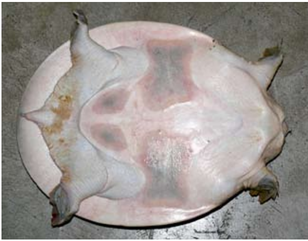
Figure 2. Chitra indica , Assam, India.

again (although invalidly; see Farkas 1994; Webb 1989) restricted to “Barrackpore (about 23 km north of Calcutta” (= Barakpur, 22°45'N 88°20'E, north of Kolkata, India) by Webb (1980).