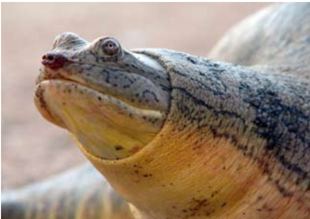
Figure 3. Chitra indica , Chambal River, Uttar Pradesh, India.

Description. — Shell widely oval and flattened; eight pairs of costals and four plastral callosities present. A single neural is present between the first pair of costals. Numer-