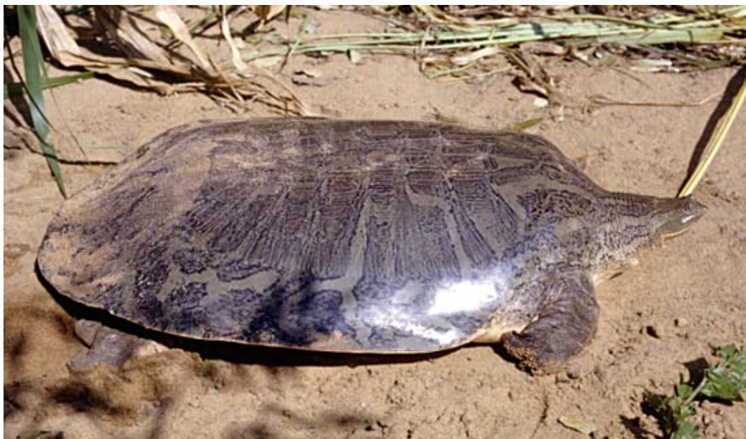
Figure 1. Chitra indica , Chambal River, Rajasthan, India.

England, which was destroyed during the air-raids of London during World War II (see Farkas 1994). The type locality was given as “India, fl. Ganges, Penang” (= Pulau Pinang, 05°30’N 100°28’E, West Malaysia), by Gray (1831), and was restricted to “Fatehgarh, Ganges” (27°22’N 79°38’E, Uttar Pradesh, northern India) by Smith (1931:162), and