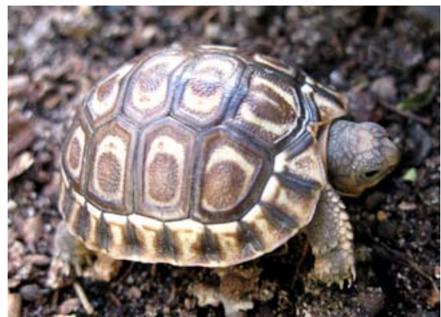
Figure 4. Hatchling Chersina angulata , from the West Coast National Park, South Africa.