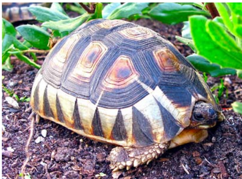
Figure 1. Subadult female Chersina angulata from the West Coast National Park, South Africa.

Testudo bellii , but synonymized it with Testudo (Chersina) angulata after he saw the specimens labeled by Duméril in the Paris Museum (Bour 2008). Gray (1831) attributed authorship of Chersina to Merrem (1820), but used the name in error