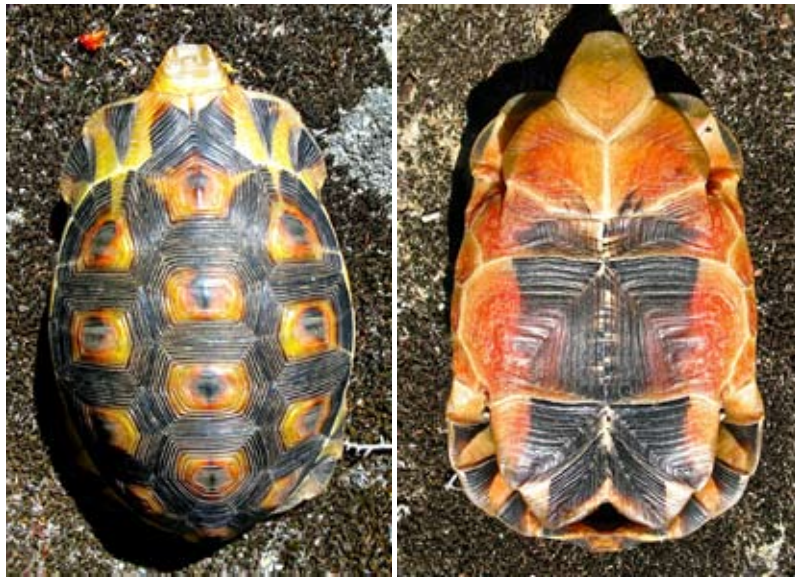
Figure 2. Young adult male Chersina angulata from Clanwilliam, South Africa, with red plastron.

because Merrem used the name Chersine as a subgeneric substitute name for Testudo (Bour 2008). Lindholm (1929) and Hewitt (1931), respectively, used the names Goniochersus and Neotestudo for Testudo angulata but Loveridge and Williams (1957) reinstated the name Chersina angulata (Bour 2008). Bour and Ohler (2008) recently argued for the retention of Chersina Gray 1831 (distinct from Chersine Merrem 1820) to maintain nomenclatural stability.