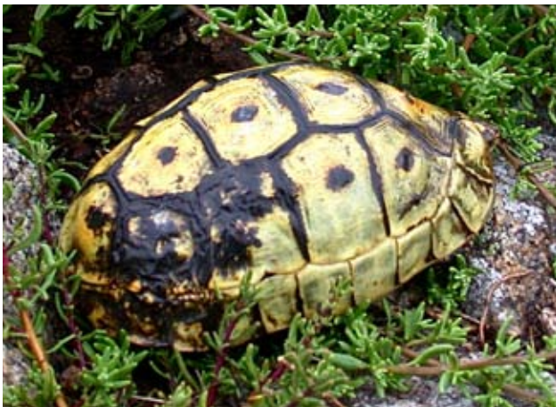
Figure 3. Old adult female Chersina angulata , from Dassen Island, South Africa, with faded color pattern and burn scars.

Description. — The shell of adult angulate tortoises is elongated and domed with no hinges. The carapace typically has five vertebrals, four paired costals, 11 paired marginals, a single supracaudal and a single nuchal scute. The plastron consists of a large, protruding, undivided gular scute, and paired humerals, pectorals, abdominals, femorals and anals. Each side has one or two axillary scutes and one inguinal scute. The front and hind limbs have five and four claws, respectively. There are no buttock tubercles, nor a terminal spine on the tail.