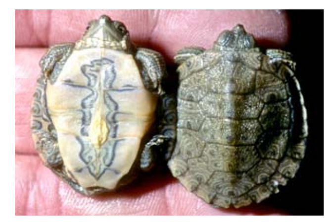
Figure 4. Trachemys gaigeae gaigeae , hatchlings, from New Mexico, USA.

The Río Nazas closed basin, and its population of T . g. hartwegi , is separated from drainages that support other Trachemys by at least 15 km of semi-arid, mountainous