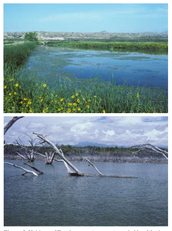
Figure 8. Habitats of Trachemys gaigeae gaigeae in New Mexico, USA, at Bosque del Apache National Wildlife Refuge ( top ) and Elephant Butte Reservoir ( bottom ).