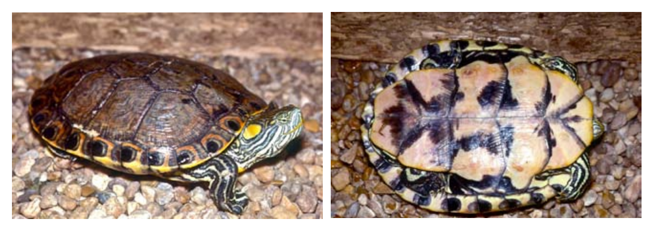
Figure 6. Trachemys gaigeae hartwegi, adult from Río Nazas, Presa Francisco Zarco, near Nuevo Graseros, Durango, Mexico.

Preliminary genetic data from the Rio Grande populations suggest that T. g. gaigeae in New Mexico are divergent from populations in Texas (Jackson et al. 2007). One hypothesis for these genetic differences is that populations in these two states are now separated by habitat loss. Populations in the Big Bend region are presumably genetically contiguous with those in the Río Conchos, but are also parapatric with native T. s. elegans in the Rio Grande below Big Bend, where some hybridization does occur (Forstner et al. in press). Hybridiza-