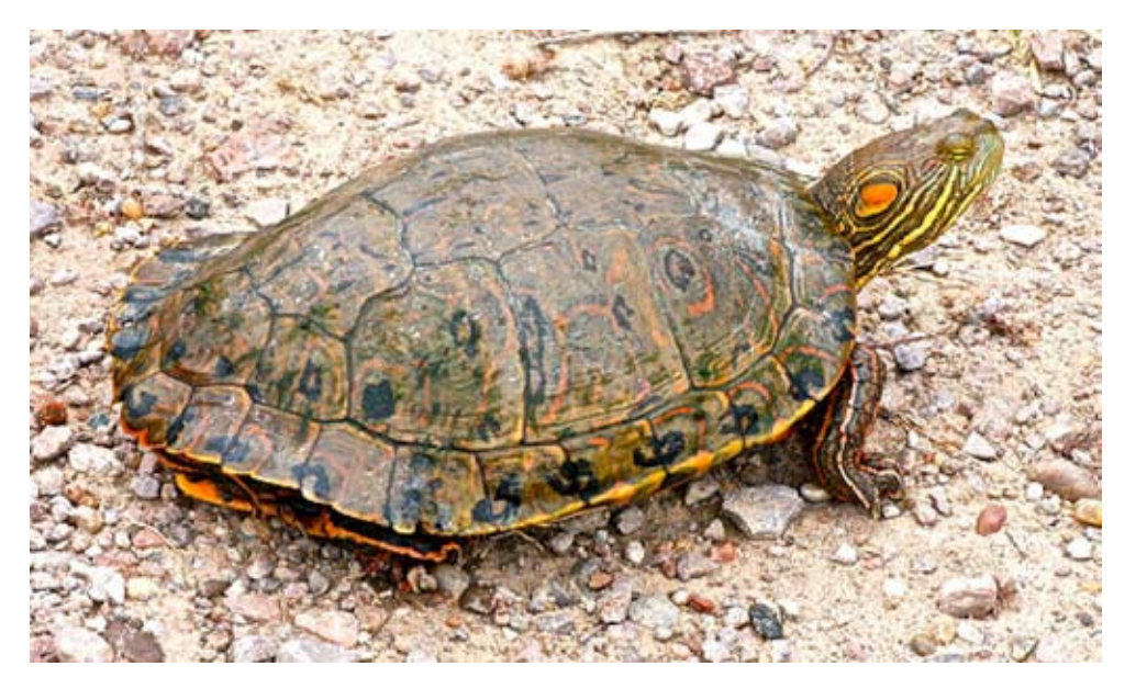
Figure 1. Trachemys gaigeae gaigeae, adult female, from Socorro County, New Mexico, USA.

STATUS. –IUCN 2009 Red List: Vulnerable (VUA1c,D2) (assessed 1996, needs updating); CITES: Not Listed; US ESA: Not Listed; New Mexico: Species of Greatest Conservation Need.