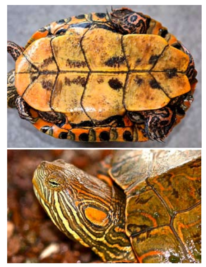
Figure 2. Trachemys gaigeae gaigeae , plastron and head of adult female, from Socorro County, New Mexico, USA.

Trachemys gaigeae has been considered by some a member of a Mesoamerican or Neotropical group of sliders (e.g., Legler 1990) or allied with cooters ( Pseudemys spp.;