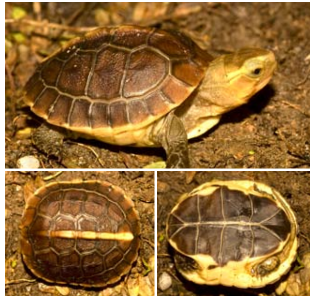
Figure 4. Hatchling Cuora flavomarginata flavomarginata from Keelung, northern Taiwan.

Hsü (1930) described a new subspecies, Cuora flavomarginata sinensis , based upon a small sample from Tungting