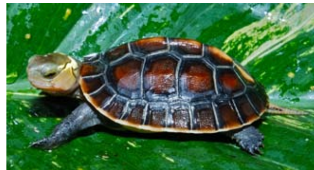
Figure 5. Hatchling Cuora flavomarginata evelynae from the Ryukyus.