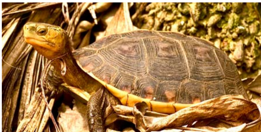
Figure 1. Cuora flavomarginata flavomarginata , adult female from Nantou, central Taiwan.

STATUS. – IUCN 2009 Red List: Endangered (EN A1cd+2cd) (assessed 2000); CITES: Appendix II (as Cuora spp.).