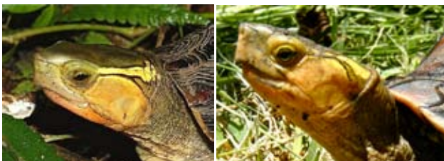
Figure 3. Left: Cuora flavomarginata flavomarginata from Keelung, northern Taiwan. Right: Cuora flavomarginata evelynae from Iriomotejima Island, southern Ryukyus.

However, Wermuth and Mertens (1961) resurrected the genus Cuora to accommodate most Asian box turtles, including flavomarginata . Recently Bour (1980) argued for the validity of Cistoclemmys and reassigned flavomarginata to this genus. Based on the results of cladistic analysis, chiefly using