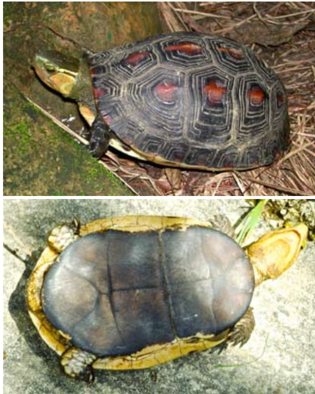
Figure 7. Cuora flavomarginata evelynae from Iriomotejima Island, southern Ryukyus. Top: adult female. Bottom: adult male.

Lake of Hunan Province, continental China. However, all diagnostic characters proposed to distinguish this subspecies from the typical form were either within the common kinds of variation to be expected in most geoemydid turtles, or were differences generally correlated with age or sex (Fang 1934; Pope 1935; Ernst and Lovich 1990).