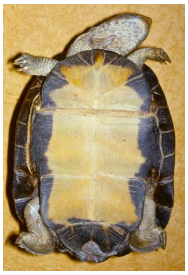
Figure 2. Pelusios sinuatus, adult female from Mpumalanga, South Africa.

onymized by Siebenrock (1903) and confirmed by Loveridge (1941). The validity of this distinctive species has never been questioned, but two subspecies have been described. Pelusios sinuatus zuluensis Hewitt 1927 was described on the basis of a series from the Umsinene River, northern KwaZulu-Natal, which were distinguished from the typical form by well developed median protuberances on vertebrals 3 and 4 and their upturned posterior marginals, both variable