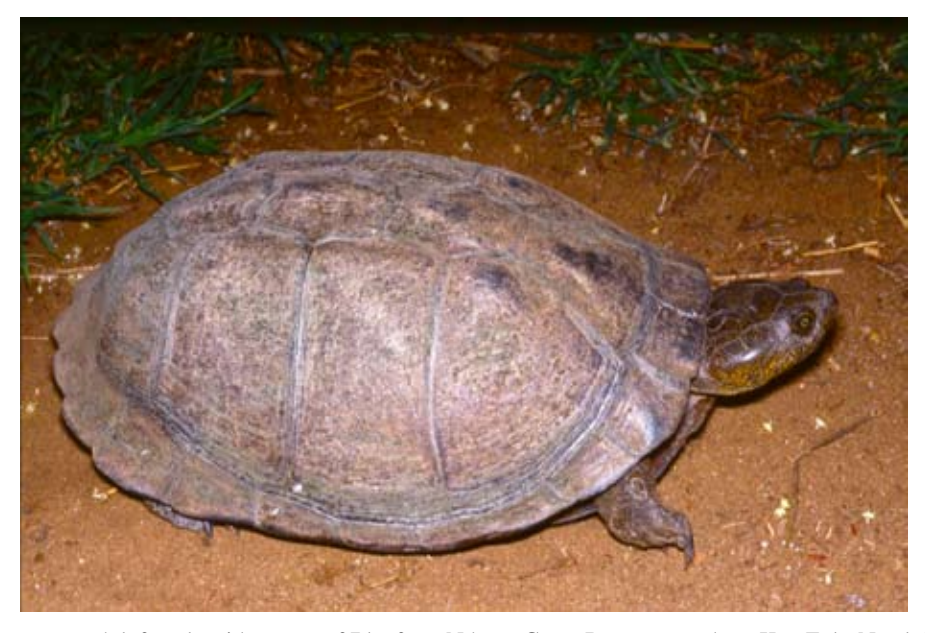
Figure 1. Pelusios sinuatus, adult female with a mass of 7 kg from Ndumu Game Reserve, northern KwaZulu-Natal, South Africa.

Province, South Africa, by Broadley, 1981). Junior synonyms of P. sinuatus include Sternotherus dentatus Peters 1848, later placed in synonymy by its author (Peters 1882), and Sternothaerus bottegi Boulenger 1895 from Somalia, syn-