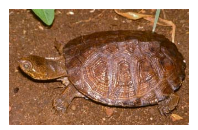
Figure 4. Pelusios sinuatus , juvenile from Balegane, northern Swaziland.

The carapace and bridge are black (rarely dark brown) but often obscured by algal growth, the plastron is yellow with a sharply defined black peripheral pattern, sometimes also with several black chevrons mesially. Hatchlings have