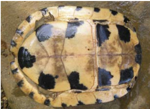
Figure 5. Cuora amboinensis kamaroma (?), Palawan, Philippines.

layan Box Turtle, respectively, constitute the known weight record for the species (Schoppe 2009).