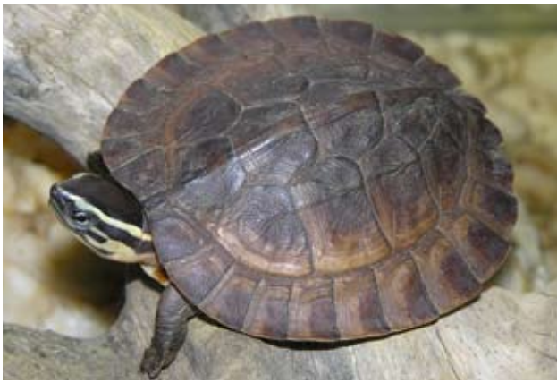
Figure 7. Juvenile Cuora amboinensis amboinensis , Luzon, Philippines.

Four subspecies are currently recognized: the East Indian Box Turtle, C. a. amboinensis (Riche in Daudin 1801), also referred to as the Wallacean Box Turtle, the Malayan Box Turtle, C. a. kamaroma Rummeler and Fritz 1991, the Indonesian Box Turtle, C. a. couro (Schweigger 1812), and the Burmese Box Turtle, C. a. lineata McCord and Philippen 1998. Rummeler and Fritz (1991) provided morphometric values such as body ratios for carapace length to body height and carapace width to body height that distinguish the first three subspecies. Accordingly, C. a. amboinensis is characterized by a flat, broad carapace with distinct margin; C. a. kamaroma is highly domed and has a narrower carapace without a well-developed margin; whereas the shell of C. a. couro shows intermediate characters (Rummeler and Fritz 1991). They also noted subtle color differences in cephalic pattern (particularly head stripes), carapace color, extent of plastron blotches, and expression of vertebral and lateral costal keels. Cuora a. lineata on the other hand can be distinguished from the former three subspecies by the total lack of carapacial keels, diminished inguinal scutes, a more flared posterior plastral lobe allowing a more completely closed posterior shell opening, and a yellowish white middorsal stripe (McCord and Philippen 1998).