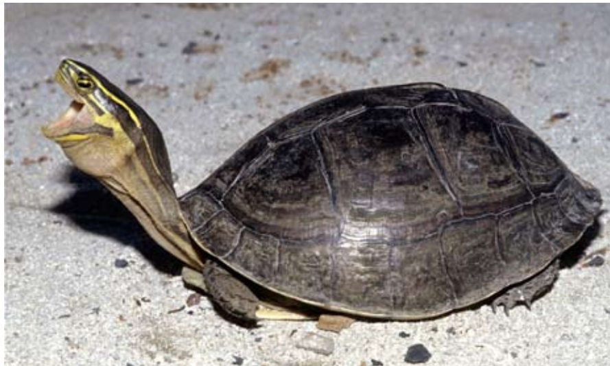
Figure 1. Cuora amboinensis kamaroma from Nicobar Islands, India.

hybrids involving C. amboinensis , namely Chinemys reevesii , C. nigricans , Cathaiemys mutica , Malayemys subtrijuga , Pyxiclemys trifasciata , and Siebenrockiella crassicollis .