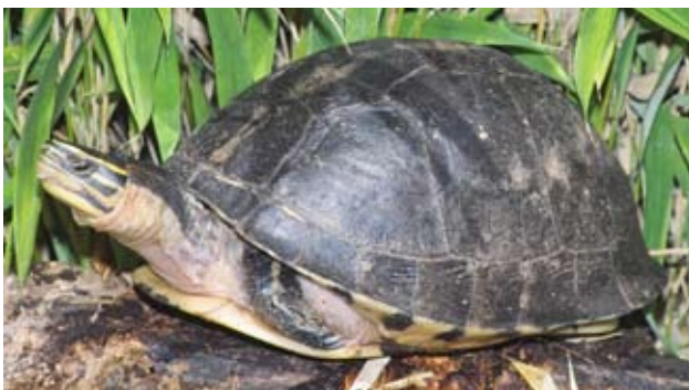
Figure 8. Cuora amboinensis lineata from Myanmar.

The two subspecies that are found in the Philippines, C. a. amboinensis and C. a. kamaroma (Gaulke 1995a, b; Gaulke and Fritz 1998), might in fact constitute morphologically