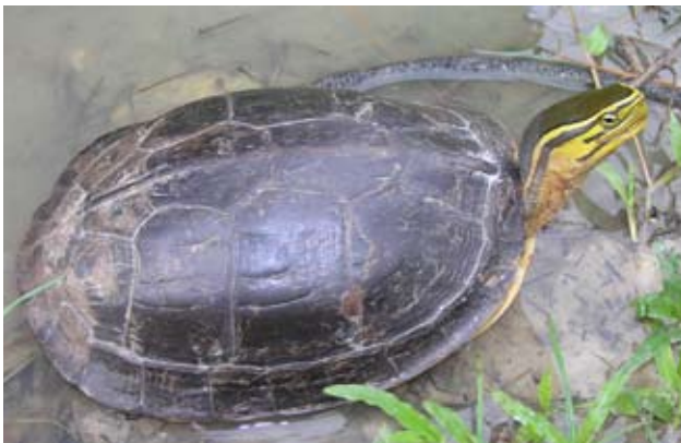
Figure 2. Cuora amboinensis amboinensis , Sulawesi, Indonesia.

The karyotype is 2n = 52 (Stock 1972; Killebrew 1977; Carr and Bickham 1986; Guo 1997) or 2n = 50 (Kiestler and Childress in Gorman 1973).