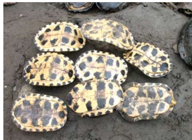
Figure 9. Cuora amboinensis lineata for sale in a trader's shop in Myitkyina, Kachin State, northern Myanmar.

The East Indian or Wallacean Box Turtle, C. a. amboinensis , occurs on the Moluccas, Sulawesi, and the Philippines (except the Sulu Archipelago) (Fritz and Havas 2007; Diesmos et al. 2008). The Malayan Box Turtle, Cuora a. kamaroma , occurs from northeastern India and Bangladesh through southeastern Asia to the Malay Peninsula, Nicobar Islands, Borneo, Sulu Archipelago, and perhaps Palawan Island group, Philippines (Fritz and Havas 2007; Diesmos et al. 2008). The hypothesis that Palawan populations may