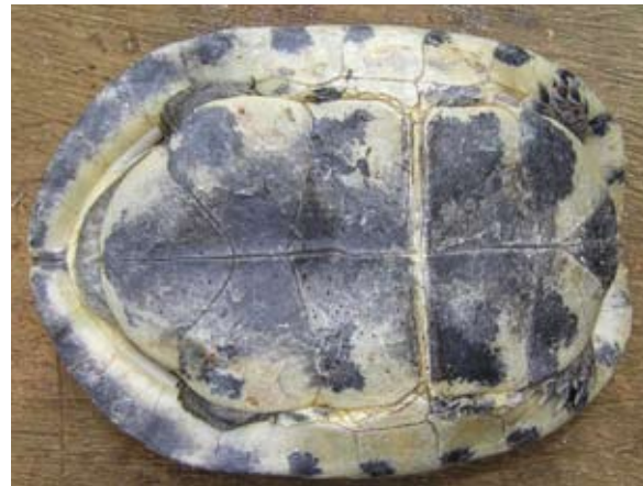
Figure 3. Cuora amboinensis couro , Indonesia.