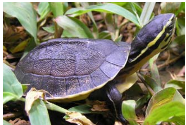
Figure 6. Hatchling Cuora amboinensis kamaroma (?), Palawan, Philippines.

Life expectancy is 25–30 years; a maximum age of 38.2 years was recorded for an animal in captivity (Bowler 1977). Generation time is ca. 18 years (Schoppe 2008, 2009). The sex ratio is 1:1 or slightly in favor of females (Schoppe 2008, 2009). Sexual dimorphism is evident at around 15 months (Schoppe 2008, 2009). Males are generally slightly smaller and lighter than females (Rummler and Fritz 1991; Schoppe 2008, 2009). Males possess a relatively longer tail and a slightly concave plastron. Males mature at a CL of 130 mm, females at 152 mm (Paull et al. 1982).