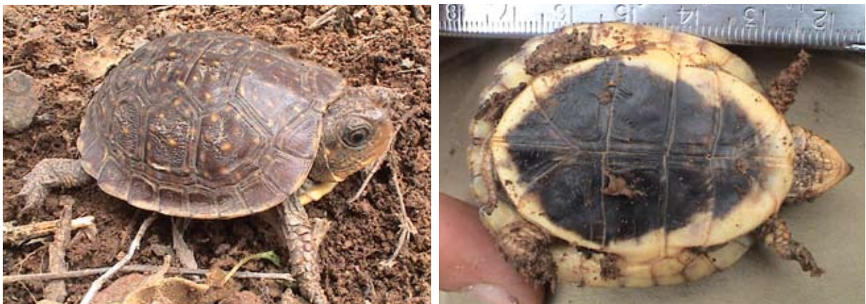
Figure 5. Post-hatchling Terrapene nelsoni klauberi , Palo Amarillo, Uruachi, Chihuahua.

Description. — Mature specimens of T. nelsoni fall within the dimensional range of adults of the more familiar T. carolina , excepting subspecies T. c. major . Milstead (1969) provided 134 mm as the average straight line carapace length (CL) of southern adults examined, the maximum being 146 mm. Northern specimens ( T. n. klauberi ) averaged 131 mm CL, with the largest measuring 151 mm. The CL of a living male Spotted Box Turtle from southern Sonora measured by