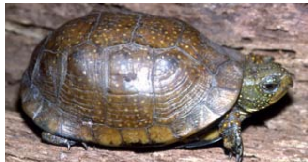
Figure 8. Adult Terrapene nelsoni nelsoni from Nayarit.