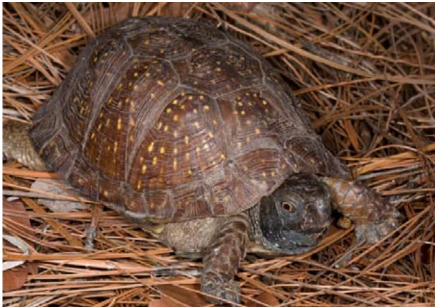
Figure 1. Adult male Terrapene nelsoni klauberi , near Yecora, Sonora.

“Sierra de Nayarit, partie occidentale” by Léon Diguët a year or two earlier (Mocquard 1899). It was not mentioned in the literature again until Smith and Smith (1979). This specimen, originally bearing the label Cistudo carolina , had been misplaced until 2001 (figured in Devaux and Buskirk 2001). Significantly, this heavily spotted specimen appears to have been a female whereas the unpatterned holotype (miscaptioned Fig. 36 of Ditmars 1934, better illustrated by Milstead 1969) is a male (Shaw 1952). Had Diguët’s female specimen from Nayarit been declared the holotype of a new species, or been available for comparison to Stejneger’s (1925) holotype, the nomenclatural history of Terrapene nelsoni surely would have evolved differently. Sexual dimorphism within Terrapene nelsoni is much more impressive than reported distinctions between the regional subspecies (Buskirk 2002).