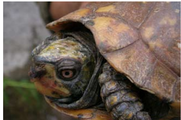
Figure 3. Old adult male Terrapene nelsoni klauberi , Rio Aros, Sonora.