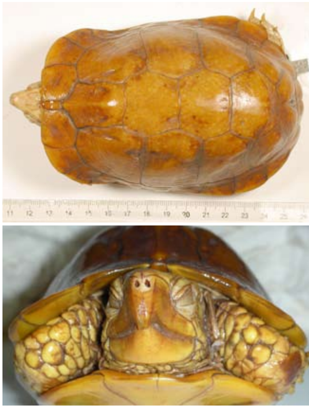
Figure 6. Preserved adult male Terrapene nelsoni nelsoni , the holotype (USNM 46252) from Pedro Pablo, Nayarit.

the first author was 159 mm (Buskirk 2002). Some degree of dorsal flattening is present, and there may be a central keel or remnants thereof on vertebrals 2 through 4, as well as faint lateral keels. The outline of the carapace may be elongate, oval, or roundish. To a varying extent, the posterior marginals may be flared in males, particularly among southern turtles (Milstead 1969, Dodd 2001).