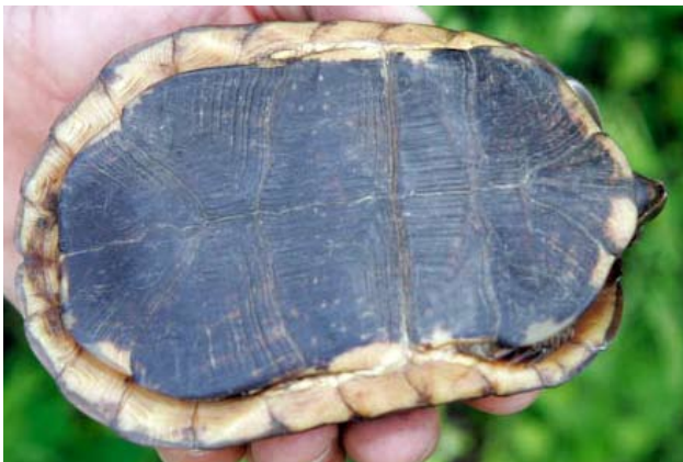
Figure 2. Subadult male Terrapene nelsoni klauberi , west of Yecora, Sonora.

and Tinkle (1967) described an “Ornata Group” and a “Carolina Group” within the genus Terrapene based on 12 morphological traits, and considered ornata and nelsoni to be sister species. Milstead (1969) expanded the criteria to 16 traits. The first workers to examine several (37) nelsoni from the type locality, as well as 13 specimens of klauberi from Sonora and the single Sinaloan specimen (a carapace and plastron only), Milstead and Tinkle (1967) further speculated on the common ancestry of T. ornata and T. nelsoni – T. klauberi , possibly through the extinct T. ornata longinsulae . That both recent members of the Ornata Group tend to inhabit savanna habitats, rather than forests or wetlands, was cited by them as further evidence of their close relationship. Milstead and Tinkle found little but plastral scute ratios and the contour of the first vertebral scute to distinguish between the southern and northern races of the Spotted Box Turtle, and limited their discussion of sexual dimorphism to the degree of flaring of the posterior marginals (more marked in the larger southern sample) and the tendency for females to be