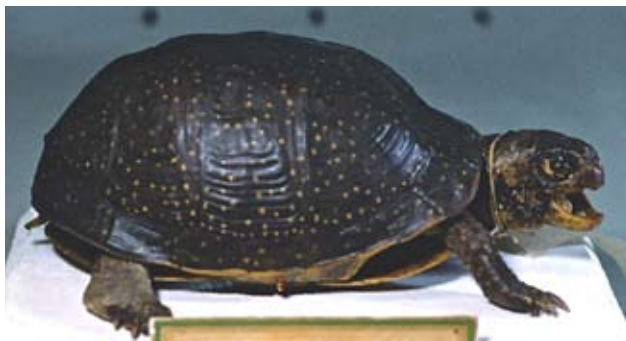
Figure 7. Stuffed adult female Terrapene nelsoni nelsoni , Diguet’s 1897 specimen from Sierra de Nayarit, Nayarit, at the MNHN, Paris.

The overall coloration of the carapace is variable, from nearly black to greenish brown, tan, or beige. Yellow or “coffee colored” spots (Milstead 1969) are usually present on the carapace and soft parts but may be absent in males (see below). The spots are variable in size from one specimen to the next, but tend to be of nearly uniform size per individual. All 30 adult specimens examined by Lemos-Espinal (2005)