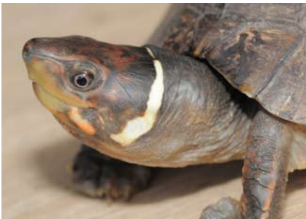
Figure 2. Subadult Siebenrockiella leytensis .

Heosemys leytensis was not included in their phylogenetic analyses due to lack of genetic samples. Following the recent rediscovery of the species (Diesmos et al. 2004), morphological study and molecular phylogenetic analysis demonstrated that leytensis is the sister lineage to the previously monotypic Sundaic turtle genus Siebenrockiella (Diesmos et al. 2005). Thus, S. leytensis is the sister species to S. crassicollis , a species that occurs from Peninsular Malaysia to Borneo (Ernst et al. 2000). Nonetheless, there is high genetic divergence (ca.13% cytb ) between S. leytensis and S. crassicol-