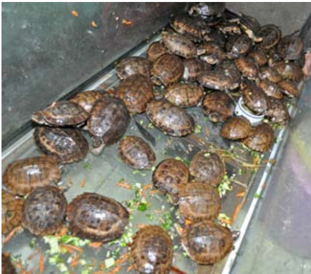
Figure 7. Illegal wildlife trade of S. leytensis is the greatest threat to the species. Over a thousand juvenile and adult turtles have already been smuggled out of Palawan to supply the illegal trade.

piners. Old adults attain a median carapace length (MCL) of more than 300 mm, a median plastron length (MPL) of over 220 mm, and weigh as much as 3.5 kg. Hatchlings are typically \leq 46 mm MCL. Range of measurements of 325 specimens is as follows (Schoppe, unpubl. data).