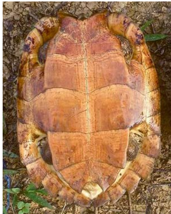
Figure 3. Adult Siebenrockiella leytensis .