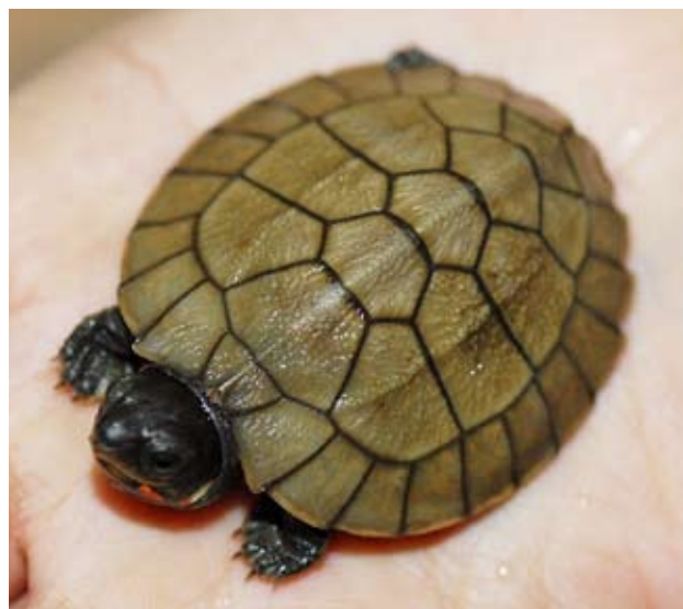
Figure 5. Hatchling Siebenrockiella leytensis .

Description. — The Palawan Forest Turtle is the largest and the heaviest geoemydid turtle known from the Philip-