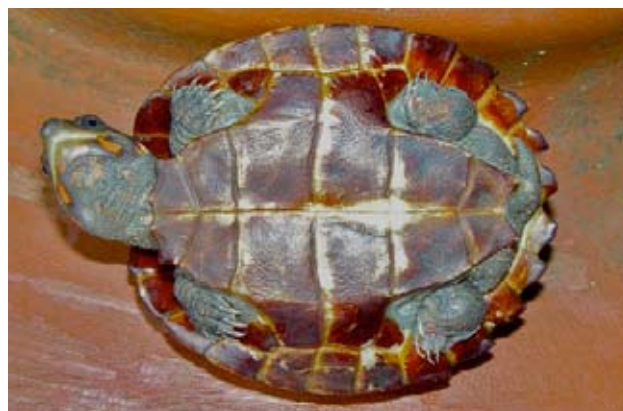
Figure 6. Juvenile Siebenrockiella leytensis .