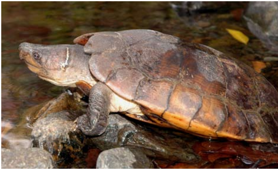
Figure 1. Adult male Siebenrockiella leytensis in its primary habitat on Palawan, the lowland riparian forests from the northern region of the island. These lowland habitats are imperiled because of slash-and-burn farming, timber poaching, charcoal making, and the impacts of mining and quarrying.

the plastron and carapace, the entoplastron intersected by the humeropectoral suture, the lack of quadratojugal bones, and the rudimentary scalation of the head (Buskirk 1989; Ernst and Barbour 1989; Ernst et al. 2000). Wermuth and Mertens (1961) suppressed Heosemys and allocated most of its member species to Geoemyda , a placement that was rejected by McDowell (1964), citing the distinctive skull anatomy of turtles within the group (see also Ernst and Barbour 1989). Nonetheless, some authors subsequently considered leytensis as a species of Geoemyda (review in Iverson 1992). McCord et al. (2000) proposed that leytensis , along with the Indian species silvatica , remain in Heosemys until more robust information on the systematics of these taxa indicated otherwise.