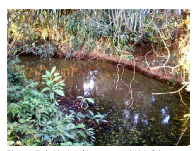
Figure 6. Typical habitat of Mesoclemmys dahli in Chimichagua, Cesar.

The species is known to estivate; when on land it remains hidden under leaf litter, tree roots, and spiny shrubs (Rueda-Almonacid et al. 2004; Forero-Medina et al. 2011). Rueda et al. (2006) have reported individuals remaining buried under leaf litter for up to 120 days. In order to avoid desiccation during estivation it retains large amounts of water in its bladder (Rueda-Almonacid et al. 2004). The authors have found specimens estivating as far as 1 km from the closest water body, or hidden under trash and leaf litter in people's backyards. Occasionally, several individuals have been observed estivating very close to each other (0.5–1 m),