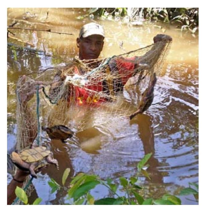
Figure 7. Capturing Mesoclemmys dahli using seine nets (2.5 cm mesh size) in Chimichagua, Cesar.

Reproduction. — Very little is known regarding the reproductive ecology of the species. Medem (1966) observed that the mating season occurred mainly in June and July for captive animals in Villavicencio, Colombia, with copulation taking place in shallow waters. He suggested that the number