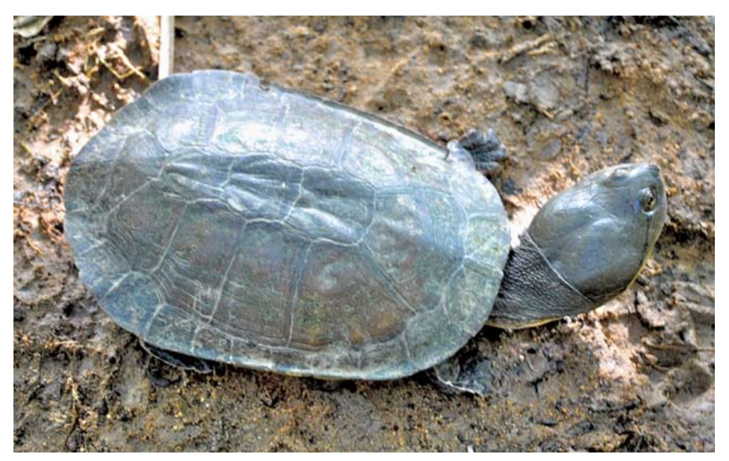
Figure 1. Adult female Mesoclemmys dahli. Note the thin black head stripe.

The species has a compressed carapace, which is olivebrown or gray, sometimes presenting a medial keel that is barely visible, mainly in juveniles. In adults there is a longitudinal dorsal depression that encompasses vertebral 2, 3, and 4. The plastron is strong and long but somewhat narrow, particularly in males (Medem 1966), and has a well-defined posterior notch.