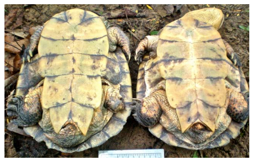
Figure 2. Ventral view of adult male (left) and female (right) Mesoclemmys dahli.

Distribution . — Mesoclemmys dahli is endemic to northern Colombia and is restricted to a small geographic