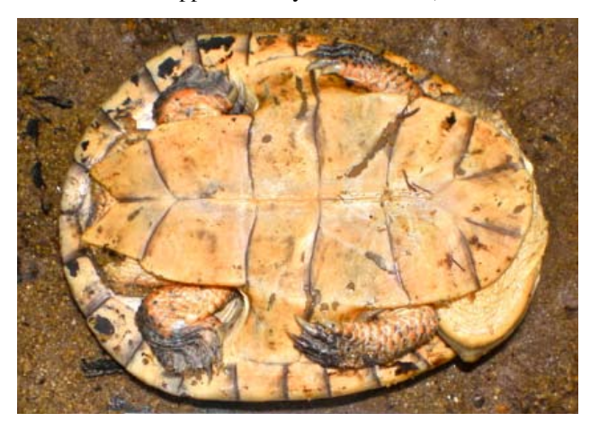
Figure 5. Juvenile Mesoclemmys dahli .

Recent niche models suggest that the species could also occur in the Department of Antioquia and therefore could occur over an area of approximately 32,000 km<sup>2</sup> (Forero-Medina