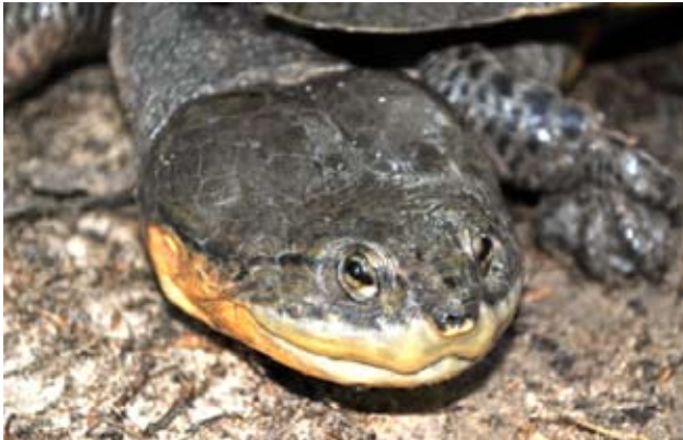
Figure 4. Large head and wide temporal region of Mesoclemmys dahli .

area. It is the only species from the family Chelidae to occur northwest of the Andes. For over 40 years after its description (Zangerl and Medem 1958), it was only known from the region of the type locality, with all observations (< 10)