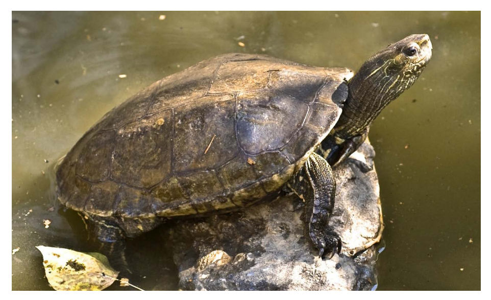
Figure 1. Adult Mauremys rivulata from Crete, Greece.

Palestine, classified the species encountered there as Emys caspica. Böttger (1880) classified this widespread species ranging from Dalmatia through the whole of Southeastern Europe, Transcaucasia, Persia, the edges of the Euphrates,