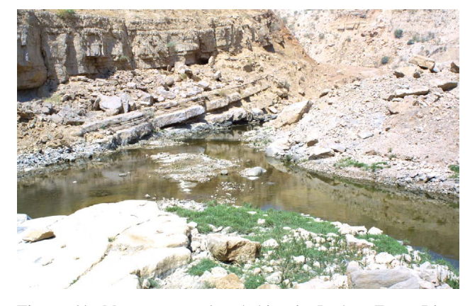
Figure 11. Mauremys rivulata habitat in Jordan: Zarqa River before the King Talal Dam (south of Jerash).

specimens exhibit obvious, reddish-brown or sometimes yellowish light and irregular reticulate patterns, that extend beyond the scutes to the adjacent scutes on a green to dark background. The plastron of younger animals is generally dark to black medially, while on the outer edges of the scutes yellowish shapes can be present. Adults rarely have light shapes; however, with age the plastron lightens up and appears more yellowish overall. The bridge is generally uniformly dark to black, sometimes light yellow spots can be seen on its margins (Wischuf and Busack 2001). The snout of M. rivulata has thin stripes that can sometimes be completely absent or often only two are present.