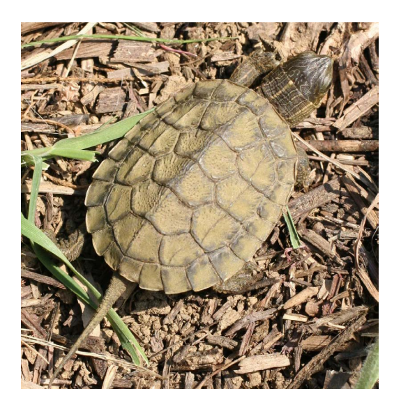
Figure 6. Hatchling Mauremys rivulata from Crete, Greece.