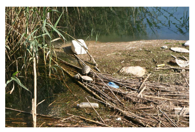
Figure 9. Polluted artificial irrigation canal on Crete, Greece, with several Mauremys rivulata basking.

The carapace of adults is usually uniformly brown, or olive green to green, with faint or no pattern. Younger