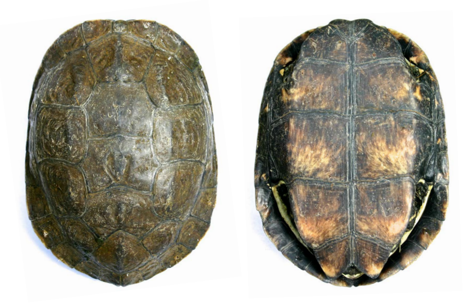
Figure 2. Adult female Mauremys rivulata from Almyros River, Irakleio, Crete, Greece.

Asia Minor, Syria and Palestine, as Clemmys caspica , but he differentiated the western populations from the eastern ones and considered them to be the subspecies Clemmys caspica rivulata . Siebenrock (1913) revised the status of the three Mediterranean taxa of the genus Clemmys ( C. caspica caspica , C. caspica rivulata , and C. leprosa ) and emphasized the differences between caspica and rivulata . He noted one of the main distinguishing characteristics of these two subspecies was the coloration of the bridge, which was yellow in caspica , but black or brown in rivulata .