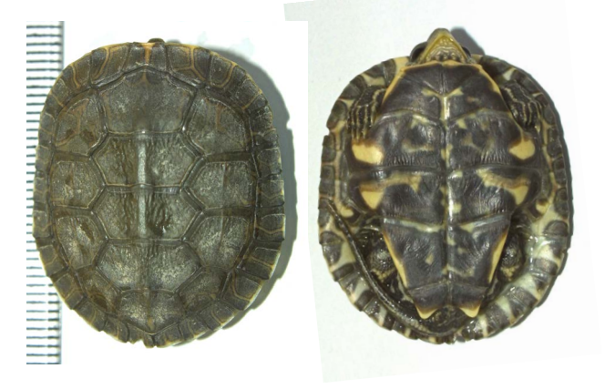
Figure 7. Hatchling Mauremys rivulata from Birket Arayes, Jordan.