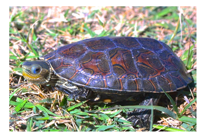
Figure 3. Male Mauremys rivulata from Birket Arayes, Jordan.

Eiselt and Spitzenberger (1967) clarifed the systematics, morphology and distribution of Clemmys caspica and its two subspecies, caspica and rivulata , in Turkey. They gave clear ranges for each subspecies, with C. c. caspica occurring in the east and southeast of the country, with C. c. rivulata in the west. They corrected several misidentifications made earlier in the literature and emphasized that there were no sympatric occurrences of those two subspecies. They noted that the nominotypic form has vertical, parallel and intensely yellow cross-stripes on the posterior sides of the legs, while these markings were absent in rivulata .