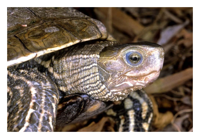
Figure 4. Head view of Mauremys rivulata from Crete, Greece.