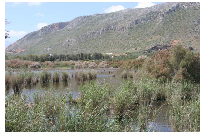
Figure 8. Shallow marshy natural Mauremys rivulata habitat on Crete, Greece, with a very dense turtle population.