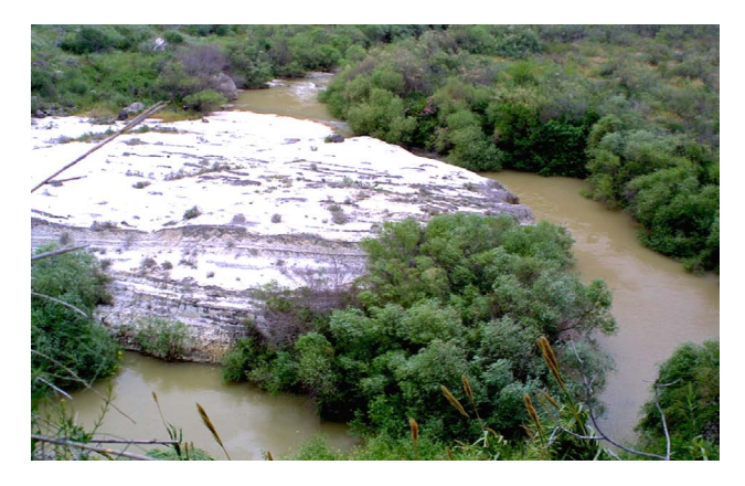
Figure 10. Mauremys rivulata habitat in Jordan: Yarmuk River.

is no evidence of gene flow between the species (Fritz et al. 2008).