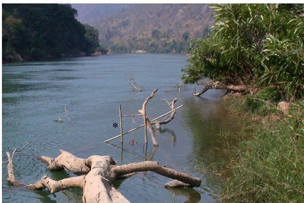
Figure 12. Habitat of Amyda cartilaginea, Dokhtawady River, Myanmar, with a local Amyda trap (*).