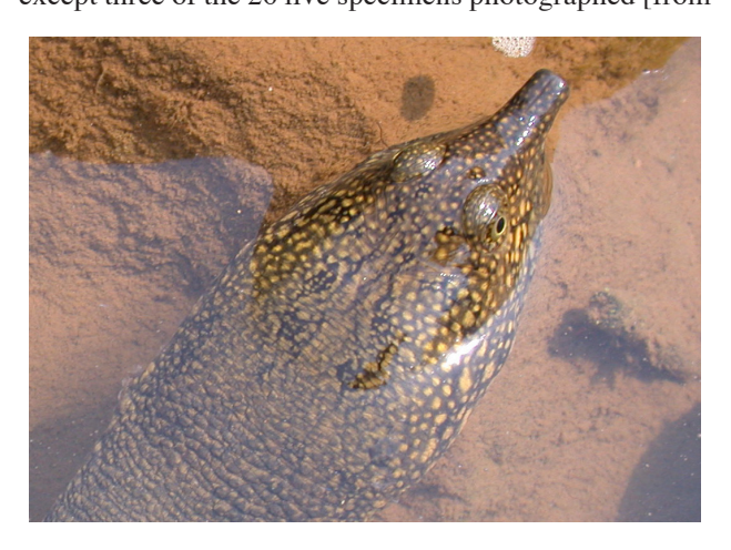
Figure 3. Adult Amyda cartilaginea , Dokhtawady River, Myanmar.

for the purposes of this conservation biology account. Their genetic analyses have suggested the existence of three major clades within the complex. Using the sister group of Amyda, Nilssonia, as a yardstick, the authors argued for the recognition of three species: an unnamed form from the north coast of Borneo, A. cartilaginea restricted to the islands of the Sunda shelf, and A. ornata, which they resurrected for the mainland forms. Within A. cartilaginea they recognized two subspecies, the nominal form A. c. cartilaginea from Java and the southeast side of Borneo, and a new subspecies, A. c. maculosa Fritz, Gemel, Kehlmaier, Vamberger, and Praschag 2014 from Sumatra and western Borneo. This new subspecies is the "saddle-blotched" form recognized by previous authors (Smith 1931; van Dijk 1992; Auliya 2000) (see Figs. 5 and 8). This pattern was also observed in specimens from northern Borneo (K. Jensen, in litt. to Auliya, 2015): "all except three of the 26 live specimens photographed [from