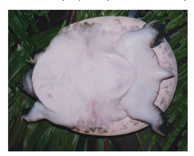
Figure 6. Adult Amyda cartilaginea , Loagan Bunut National Park, Sarawak, Malaysia (Borneo).

The carapace of this species usually consists of 9 neural bones, with the first two fused, and 8 pairs of costals with the last pair unreduced (Meylan 1987). In addition to the standard trionychid pattern of pits in the carapacial bones, small individuals of Amyda also show a rather distinctive presence of a few sinuous longitudinal bony ridges stretching across several pleural bones. The plastron has five (sometimes poorly developed) callosities and very