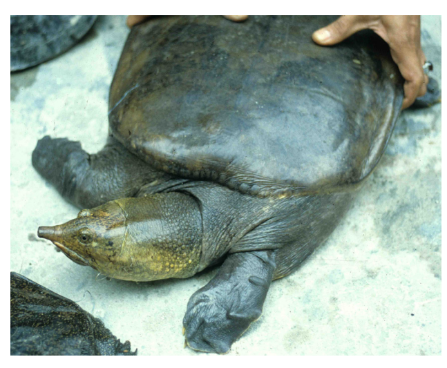
Figure 5. Adult Amyda cartilaginea , Anjungan, West Kalimantan, Indonesia.

Amyda ornata (Gray 1861) has priority for the mainland species level clade recognized by Fritz et al. (2014). Within this clade, the authors recognized three subspecies: the nominal form, A. o. ornata, from Laos and Cambodia; A. o. phayrei, new combination, for the form that is so far known from Thailand, Myanmar, and trade material from Yunnan; and a currently unnamed form from Bangladesh. These authors correctly argued that their work should increase conservation concern for A. cartilaginea (sensu lato) as it actually represents multiple taxonomic entities. However, incomplete geographic sampling in key areas and the likelihood of further taxonomic adjustment suggest that full incorporation of this developing taxonomy into this account would be premature.