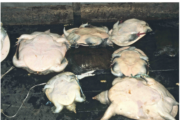
Figure 13. Amyda cartilaginea and Dogania subplana collected for the consumption trade in Sambas, West Kalimantan, Indonesia.

Population Status. — Historically, this was an abundant species throughout its range. Smith (1931) found A. cartilaginea to be common in central Thailand, frequently met with in the Chao Phrya River in the vicinity of Bangkok. It is still one of the most abundant turtle species in Thailand despite considerable hunting pressure. It is not rare in the wild and there is a regular supply to the markets, although as early as 1992 the supply in peninsular Thailand was no longer as plentiful as it was in the 1970s (W. Nutaphand, pers. comm. 1992 to PPvD). Bourret (1939, 1941) found it to be the most common freshwater turtle in watercourses at low and moderate elevations in southern Indochina.