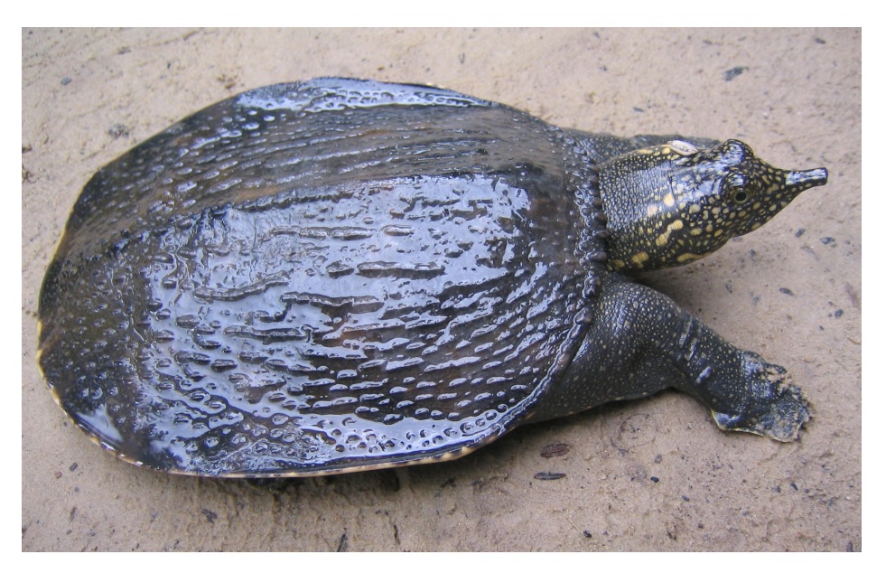
Figure 1. Subadult Amyda cartilaginea from the Cardamom Mountains, southwest Cambodia.

in Geoffroy Saint-Hilaire 1809, cariniferus Gray 1856, ornatus Gray 1861, phayrei Theobald 1868, jeudi Gray 1869 (see Anderson 1871), and nakornsrithammarajensis Nutaphand 1979.