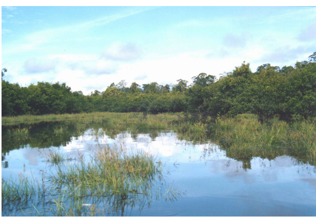
Figure 9. Amyda habitat from Loagan Bunut National Park, Sarawak, Malaysia (Borneo).