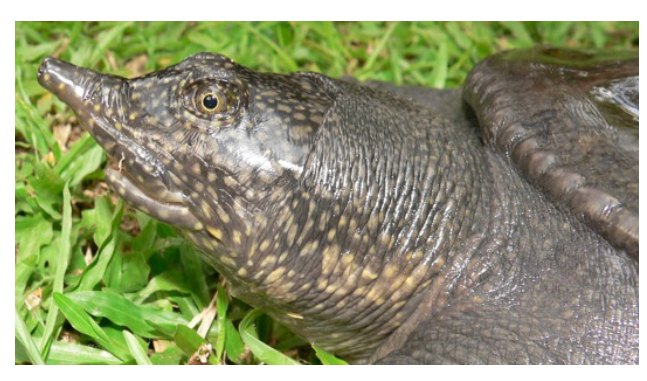
Figure 4. Adult Amyda cartilaginea in captivity in Java, Indonesia.

northern Borneo] had a saddle shape of black spots on the forward area of the carapace. Those with saddles also had a medial, black streak near the posterior of the carapace and circles or blotches near the margins made of smaller black spots. These patterns could also be seen on the preserved specimens from the Sarawak Museum. All but one of these animals had the black saddle, black streak near the posterior of the carapace and the circles of blotches on the carapace."