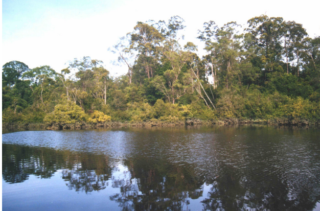
Figure 10. Habitat of Amyda cartilaginea at Loagan Bunut National Park, Sarawak, Malaysia (Borneo).

Distribution. — This species occurs naturally from easternmost Bangladesh and India (Mizoram), east to Vietnam and south across Malaysia and Indonesia at least as