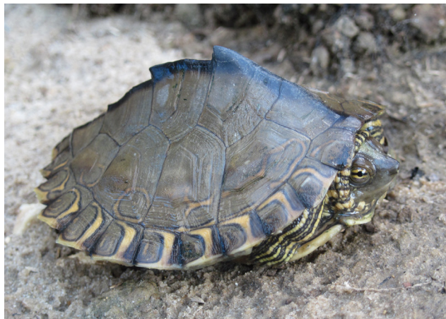
Figure 5. A yearling Graptemys pearlensis from the Pearl River, upstream of Monticello, Lawrence County, Mississippi.

Graptemys pearlensis is a carnivorous species and exhibits a broader diet than G. gibbonsi (McCoy and Vogt, unpubl. data). Females and males likely exhibit different dietary preferences due to sexual dimorphism (Gibbons and Lovich 1990; Lindeman 2000). Females possess larger heads and alveolar widths and probably consume more mollusks, while males and smaller females are largely insectivores. Cagle (1952) reported stomach contents of two males, which consisted of only insect remains, while a juvenile female stomach included mollusks (clams and snails). Not separating males and females or standardizing for size, McCoy and Vogt (unpubl. data) found G. pearlensis consumed mostly scavenged fish (44%) and equal portions by volume of insects and mollusks (25%) in stomach contents. Detailed