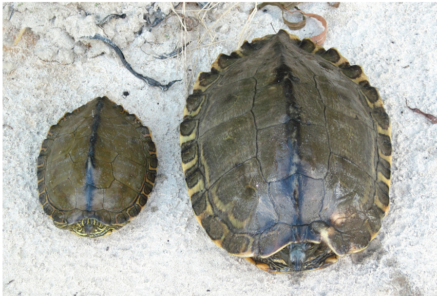
Figure 4. Graptemys pearlensis displays sexual dimorphism between males (left) and females (right). Both individuals were captured in the Pearl River near Monticello, Mississippi, USA.

point, a curved or transverse bar under the chin, and a heart-shaped pattern behind the interorbital blotch.