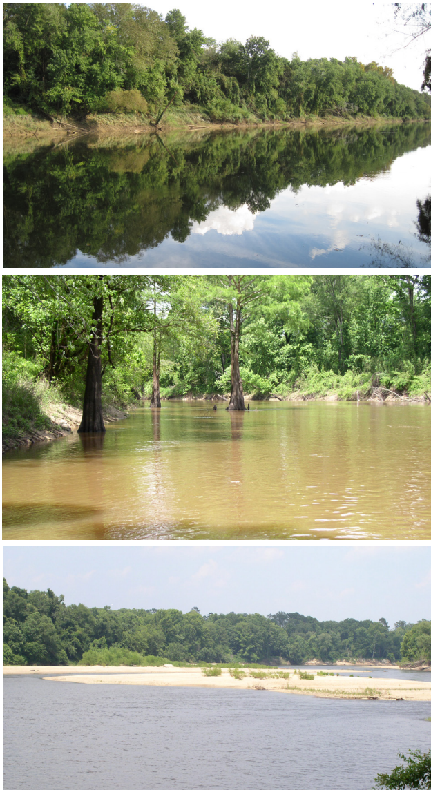
Figure 7. Habitats of Graptemys pearlensis in the Pearl River, Mississippi. Top: Type locality near Georgetown, Copiah County. This site is typical habitat with a wooded riparian zone and ample basking sites. Middle: Upper portion of the Pearl River near Carthage, Leake County; the species is found in relatively high densities at this site. Bottom: Upstream of Columbia, Marion County; sandbars provide nesting habitat and the gravel bar provides foraging opportunities, as it has a relatively dense population of freshwater mussels.

36.6 mm over a two-year period, growing 19.7 mm in the first season and 16.9 mm in the second.