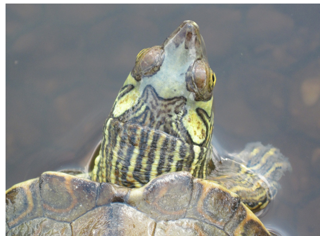
Figure 3. Head pattern of a male Graptemys pearlensis from the Pearl River near Monticello, Mississippi, USA.

The species within the pulchra clade differ based on several pigmentation features. A connection between the interorbital and postorbital blotches is found in G. pulchra , G. gibbonsi , and G. pearlensis . A nasal trident is found in G. ernsti , G. gibbonsi , and G. pearlensis , but less frequently in G. gibbonsi . Supraoccipital spots are usually present in G. ernsti but are absent in all other species. Unique to G. barbouri are a narrow interorbital blotch that ends anteriorly in a narrow