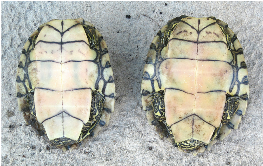
Figure 2. Plastron patterns of two male Graptemys pearlensis from the Pearl River near Monticello, Mississippi, USA.

includes G. pulchra ( sensu stricto ), G. ernsti , G. barbouri , and G. gibbonsi ( sensu stricto ). Additional information on the taxonomic history of G. pearlensis can be found in Ennen et al. (2012). All five species can be differentiated on the basis of morphology and pigmentation patterns and they exhibit mtDNA divergence (Lovich and McCoy 1992; Lamb et al. 1994; Ernst and Lovich 2009; Ennen et al. 2010).