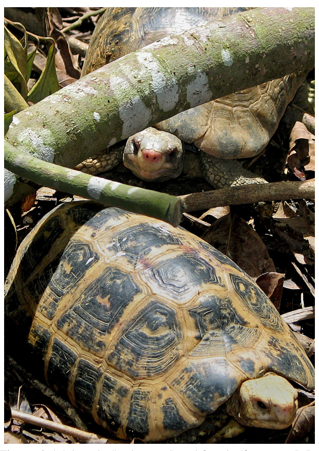
Figure 6. Adult male (background) and female (foreground) In dotestudo elongata at the Turtle Conservation Centre in Cuc Phuong National Park, Vietnam. These individuals demonstrate the characteristic of sexual dimorphism in the degree of pink nasal coloration that occurs during the breeding season.

Males generally grow larger than females. In males, the tail is longer, thicker, and has a larger and more curved horny tubercle at the terminal end (Boulenger 1889; Taylor 1970; Biswas et al. 1978; Manthey and Grossmann 1997). The plastron of males is concave in contrast to being flat in females (Manthey and Grossmann 1997; van Dijk 1998; Senneke 2000; Auliya 2007). The anal notch of the plastron in males is generally narrower and V-shaped compared to the wider notch of females (Biswas et al. 1978; van Dijk 1998; Fig. 3). Females are more rounded in body shape and possess longer and more curved posterior claws (Senneke 2000). During the breeding season, mature individuals of both sexes develop a distinct pinkish coloration surrounding the nostrils and eyes (Spencer 1988; Zeitz 1988; McCormick