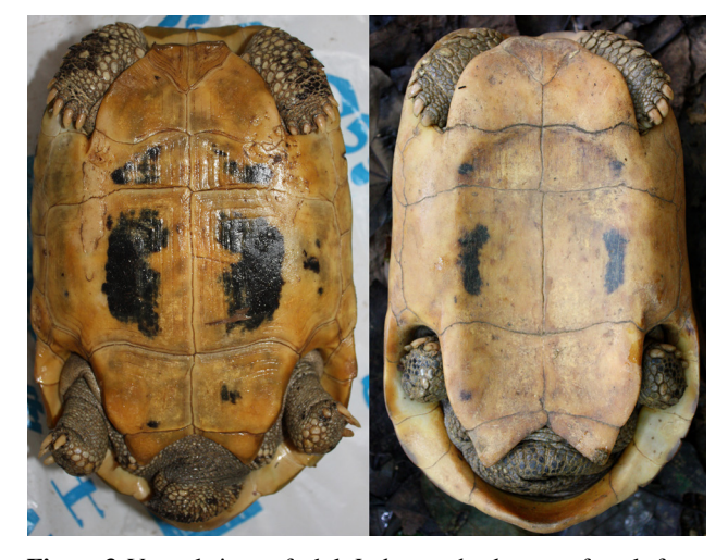
Figure 3. Ventral views of adult Indotestudo elongata , female from northern Cambodia ( left ) and male from the Turtle Conservation Centre in Cuc Phuong National Park, Vietnam ( right ).