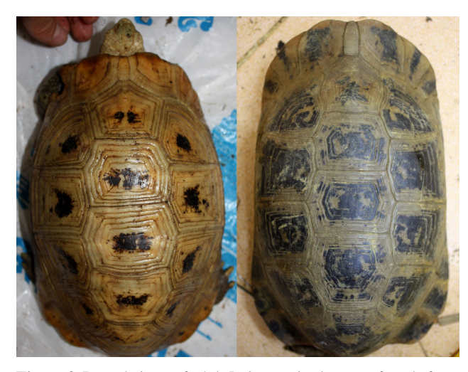
Figure 2. Dorsal views of adult Indotestudo elongata , female from northern Cambodia ( left ) and male from the Turtle Conservation Centre in Cuc Phuong National Park, Vietnam ( right ).

lengths (SCL) of up to 360 mm (Taylor 1970; Stuart et al. 2001, Auliya 2007), although most specimens are smaller with SCLs of 280-300 mm. The eponymous, elongated shell is highly domed with its highest point in the third vertebral scute (Das 2010). The carapace is flattened dorsally, broadest posteriorly, and possesses a single large recurved caudal scute (Fig. 2). A long and narrow nuchal scute is also typically present, but may occasionally be absent (Boulenger 1889; Smith 1931; Bourret 1941; Taylor 1970; Biswas et al. 1978; Manthey and Grossmann 1997; Auliya 2007; Das 2010). The carapace and plastron are yellowish brown or olive in color with more or less distinct black blotches in the center of each scute (Smith 1931; Taylor 1970; Manthey and Grossmann 1997; Senneke 2000; Stuart et al. 2001; Auliya 2007; Das 2010). The plastron is elongated, truncated anteriorly, and possesses a distinct posterior notch (Bourret 1941; Taylor 1970; Das 2010; Fig. 3). The head is of moderate size,