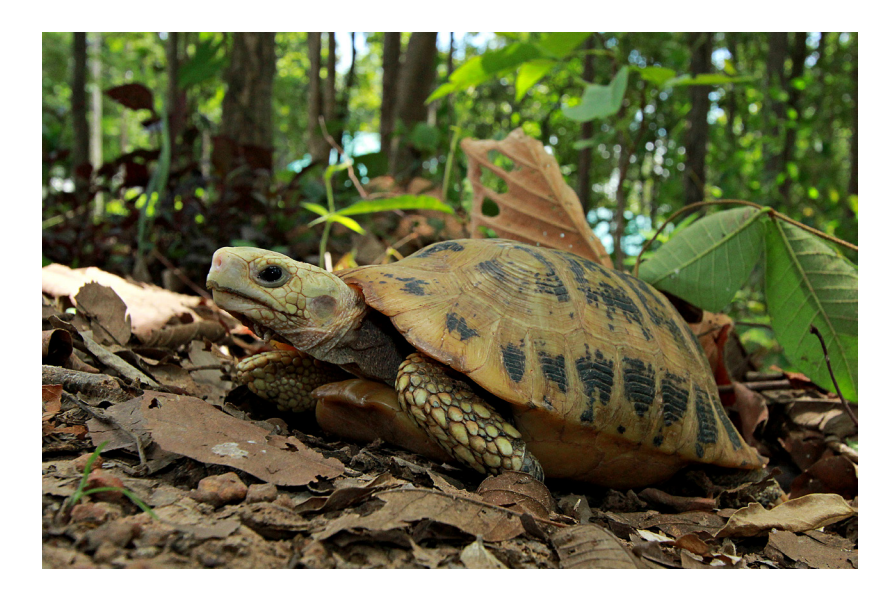
Figure 1. Adult male Indotestudo elongata in Doi Phu Nang National Park, Phayao Province, northern Thailand.

the type species of the newly created subgenus Indotestudo . Indotestudo was elevated to a distinct genus by Bour (1980) and Crumly (1982, 1984), and this was subsequently widely accepted.