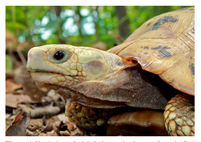
Figure 4. Head view of adult Indotestudo elongata from the Doi Phu Nang National Park, Phayao Province, northern Thailand.

yellow, covered with large symmetrically arranged scales, and possesses a slightly tricuspid hooked upper jaw with slightly denticulated horny edges (Gray 1870; Boulenger 1889; Bourret 1941; Taylor 1970; Manthey and Grossmann 1997; Stuart et al. 2001; Auliya 2007; Das 2010; Fig 4). The forelimbs are covered with imbricating anteriorly enlarged scales (Boulenger 1889; Taylor 1970). The tail terminates