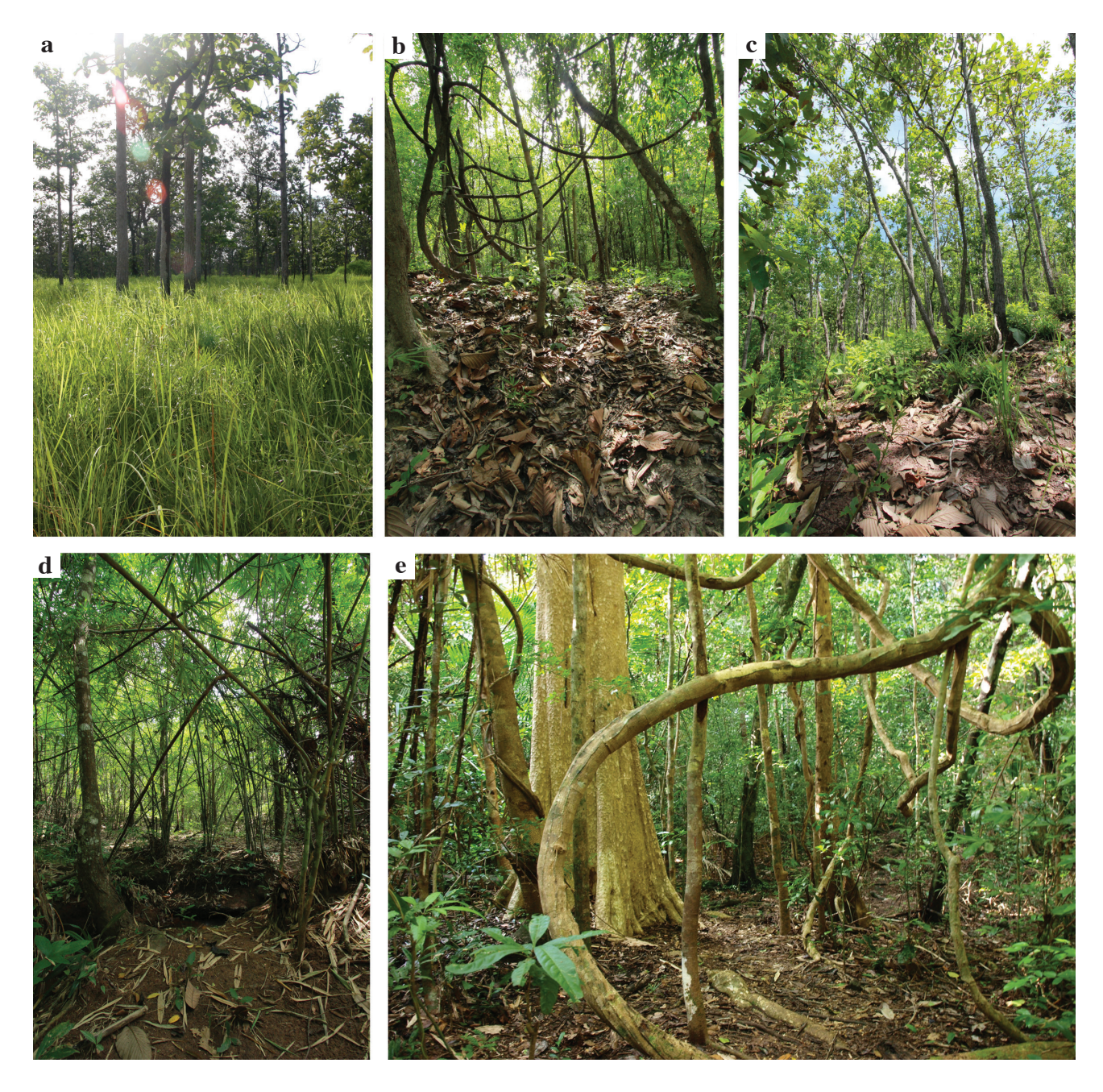
Figure 8. Examples of habitats used by Indotestudo elongata . a : deciduous dipterocarp forest habitat at the Kulen Promtep Wildlife Sanctuary, northern Cambodia (photo by Flora Ihlow); b : dry deciduous forest of Doi Phu Nang National Park, Phayao Province (photo by Flora Ihlow) and in c : Chiang Mai Province (photo by Flora Ihlow), both in northern Thailand; d : bamboo forest in Phitsanulok Province, northern Thailand (photo by Flora Ihlow), and e : secondary forest at Cat Tien National Park, southern Vietnam (photo by Peter Geissler).

McCormick (1992) reported that captive females reach sexual maturity between 178–203 mm SCL at 7 years of age, while Senneke (2000) and Eberling (2001) stated that females in captivity become mature at 220–230 mm SCL with a body mass of 1900 g. Van Dijk (1998) reported maturity in a male, not yet showing any external male characteristics, at 206 mm SCL and 1100 g and maturity in a female with a SCL of 198 mm and mass of 1000 g. According to Sriprateep et al. (2013), in northern Thailand, males mature at 6 years old with a SCL over 175 mm, while females take much longer