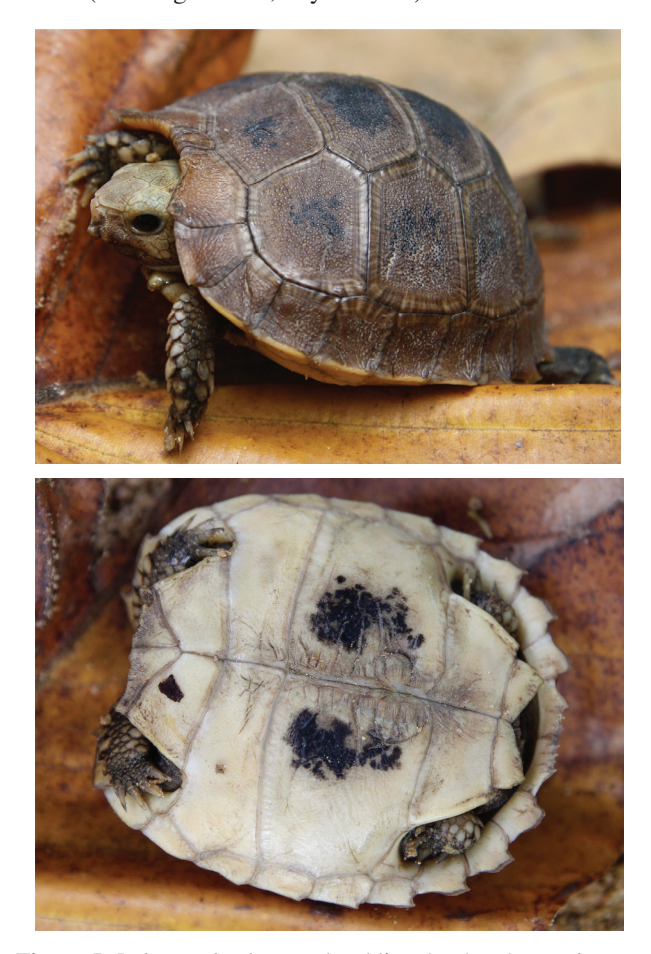
Figure 5. Indotestudo elongata hatchling, bred under semi-natural conditions in a large outdoor enclosure at the Angkor Centre for Conservation of Biodiversity, Phnom Kulen National Park, Cambodia.

yellow, covered with large symmetrically arranged scales, and possesses a slightly tricuspid hooked upper jaw with slightly denticulated horny edges (Gray 1870; Boulenger 1889; Bourret 1941; Taylor 1970; Manthey and Grossmann 1997; Stuart et al. 2001; Auliya 2007; Das 2010; Fig 4). The forelimbs are covered with imbricating anteriorly enlarged scales (Boulenger 1889; Taylor 1970). The tail terminates