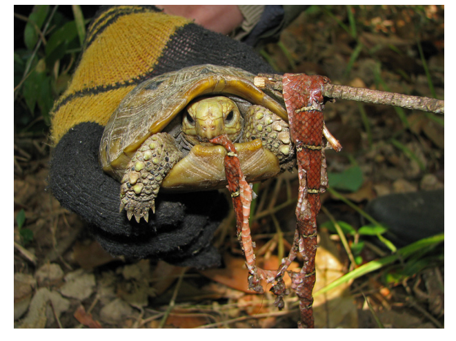
Figure 9. Juvenile Indotestudo elongata from the Nakai-Nam Theun National Biodiversity Conservation Area, Khammouane Province, central Laos, feeding on the decomposed carcass of a snake, Oligodon albocinctus .

In the wild, hatchlings emerge at the beginning of the subsequent rainy season (Cox et al. 1998; van Dijk 1998; Ihlow et al. 2011; Sriprateep et al. 2013; Ihlow et al. 2014). The lack of caruncles on hatchlings found in Thailand suggests that hatchlings might stay in the nest cavity to emerge with the first rain (van Dijk 1998). In captivity, successful egg incubation takes between 98–134 days at temperatures between 26.6 and 29.4°C. At a constant 28°C,