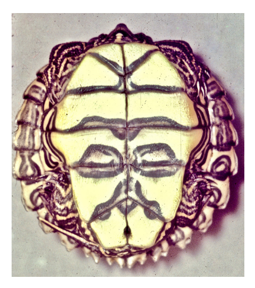
Figure 8. Graptemys ouachitensis ouachitensis hatchling, Stoddard, Vernon Co., Mississippi River, Wisconsin, USA.