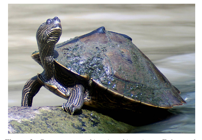
Figure 2. Graptemys ouachitensis sabinensis , nr. Estherwood, Acadia Parish, Louisiana, USA.

Praschag et al. (2017), based on mitochondrial and nuclear DNA, concluded that G. ouachitensis and G. pseudogeographica are a single species, and that the entire genus Graptemys is overly split. Thomson et al. (2018) disagreed and presented a comprehensive phylogeny of Graptemys based on 18 nuclear genes and 2 mitochondrial