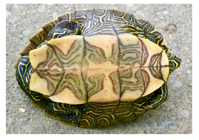
Figure 3. Graptemys ouachitensis sabinensis , Calcasieu River, Louisiana, USA.