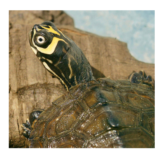
Figure 7. Graptemys ouachitensis ouachitensis, Mississippi River, Minnesota, USA.

The head is dark green with yellow markings, never orange as in some populations of G. pseudogeographica. A suborbital large blotch extends posteriorly to meet a pair of longitudinal narrower lines running the length of the head. This wide "crescent" is usually broken behind the eye and may have from 1 to 4 wide yellow lines in contact with the orbit and a large yellow spot below the eye. Incubation