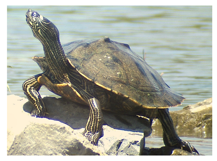
Figure 1. Graptemys ouachitensis ouachitensis, Paris Landing State Park, Henry Co., Tennessee, USA.

2013), basically because it has a distinct allopatric range; however, some individuals in the population have identical head markings to the Ouachita Map Turtle ( G. o. ouachitensis ), including individuals in the type series, so the validity of recognizing this disjunct population as a separate species needs a more detailed phylogenetic study (Vogt 1978, 1993a, 1995; TTWG 2017). Other studies suggest that G. sabinensis is a species distinct from G. ouachitensis (Stephens and Wiens 2003, 2009c; Meyers 2008; Wiens et al. 2010; Brown et al. 2012).