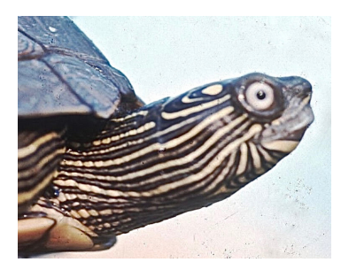
Figure 4. Graptemys ouachitensis sabinensis , Sabine River, nr. Many, Louisiana, USA.

Description . — The Ouachita Map Turtle, Graptemys o. ouachitensis is a medium-sized river turtle; females are larger at 120–260 mm carapace length and males smaller at 90–160 mm. The carapace is elevated with low black knobs on the second, third, and fourth vertebrals. The plastron is flat. The carapace is green to olive with 1 to 6 (usually 1) black blotches on the posterior edge of each scute. These