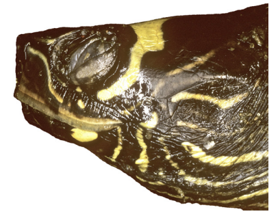
Figure 5. Graptemys ouachitensis ouachitensis , Stoddard, Vernon Co., Mississippi River, Wisconsin, USA.