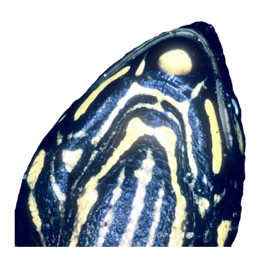
Figure 6. Graptemys ouachitensis ouachitensis , Stoddard, Vernon Co., Mississippi River, Wisconsin, USA.

blotches are encircled with yellow or orange rings forming ocelli, or a lattice of interconnected circles may be present without black blotches. This pattern is often faded in adult females, and complete melanism of the carapace is frequent in northern populations.