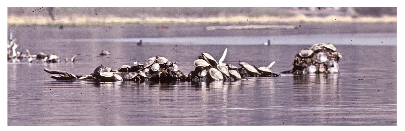
Figure 10. Basking congregation of Graptemys ouachitensis ouachitensis , Graptemys pseudogeographica , and Graptemys geographica , Stoddard, Vernon Co., Mississippi River, Wisconsin, USA.

Habitat and Ecology. — The Ouachita Map Turtle is primarily a river turtle, although it is also found in oxbow lakes and impoundments (Lake Texoma in Oklahoma-Texas and Toledo Bend in Texas-Louisiana). It frequents the faster moving sections of the river, and can be found feeding in areas with submerged aquatic vegetation. It is noticeably absent