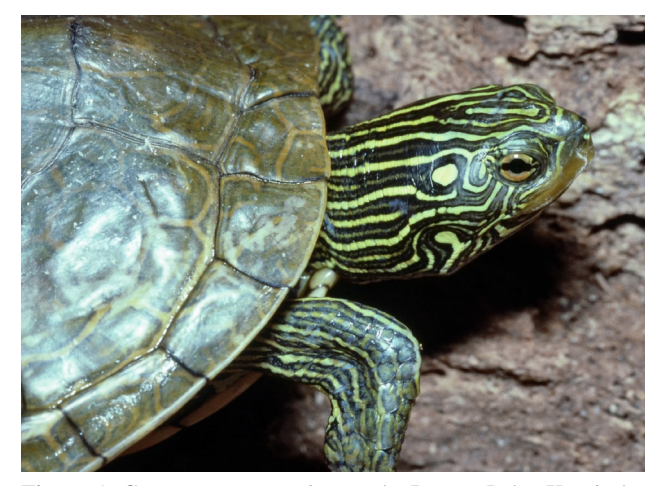
Figure 4. Graptemys geographica male, Dewart Lake, Kosciusko Co.. Indiana, USA.