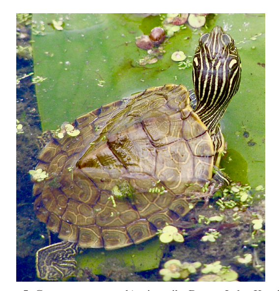
Figure 5. Graptemys geographica juvenile, Dewart Lake, Kosciusko Co.. Indiana, USA.