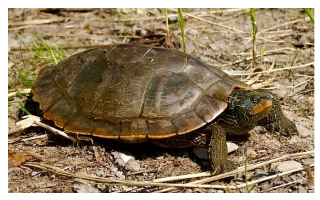
Figure 1. Graptemys geographica female, Quebec, Canada.

Mississippi River, Minnesota, where the two species cooccur, Mitchell et al. (2016) found nuclear alleles specific to G. pseudogeographica in G. geographica , but did not find any interspecific introgression of mitochondrial alleles.