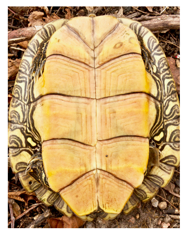
Figure 2. Graptemys geographica female, Lake Opinicon, Ontario, Canada.