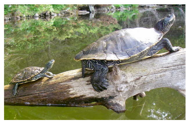
Figure 8. Graptemys geographica male and female basking, Lake Opinicon, Ontario, Canada.

availability of suitable nesting sites such as landscaped garden beds.