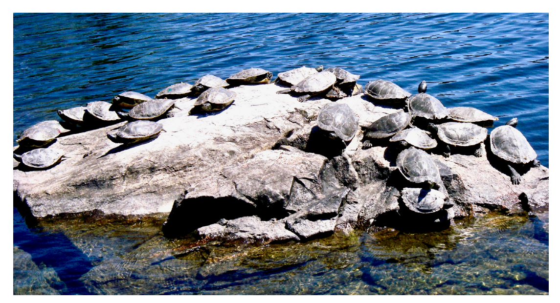
Figure 9. Graptemys geographica females near hibernation site, Lake Opinicon, Ontario, Canada.

Little is known about habitat selection during hibernation, but G. geographica is considered anoxia intolerant (Jackson et al. 2007), and oxygenated water is essential during hibernation, at least for northern populations (Ultsch 2006). Reese et al. (2001) found that adult females submerged in anoxic water at 3°C displayed metabolic acidosis and died after 45 days. In contrast, turtles submerged in normoxic water at the same temperature survived for 5 months without any signs of lactate buildup or decrease in blood pH. Hatchlings are even less tolerant of anoxia than adults. When submerged in anoxic water at 3°C, hatchlings survived for only 15 days (Reese et al. 2004). The blood chemistry of females hibernating under natural conditions indicated that G. geographica relies on aerobic metabolism during hibernation (Crocker et al. 2000). How G. geographica exchanges gases when water bodies are ice-covered is unknown, but may include cutaneous, buccopharyngeal, and cloacal respiration. Graham and Graham (1992) measured oxygen consumption in a hibernating adult male as well as in two hibernating adult females submerged at 3°C. The male was more active and consumed 2.4 to 2.8 times more oxygen per unit of mass than the females. In absolute terms, however, the males consumed 3.7 to 4.1 times less oxygen than the females because of their much smaller mass (188 g vs 1834 and 1964 g). When scuba diving at a communal hibernation