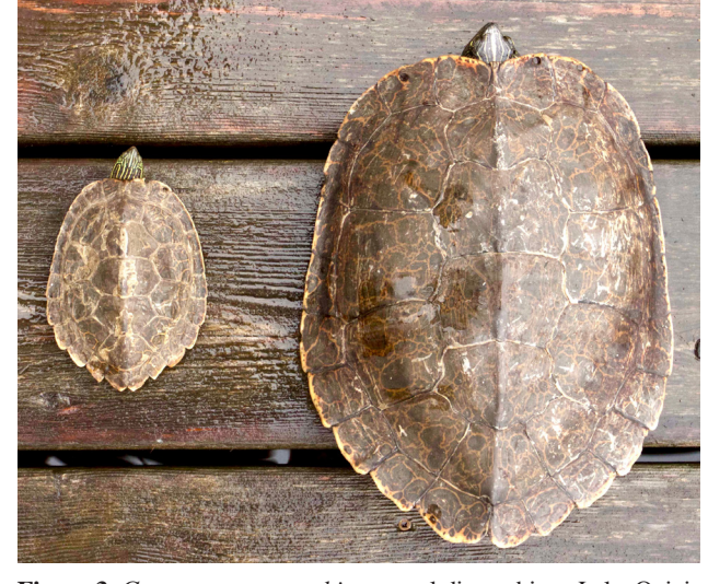
Figure 3. Graptemys geographica sexual dimorphism, Lake Opinicon, Ontario, Canada (adult male on left, adult female on right).

Habitat and Ecology. — Graptemys geographica inhabits rivers and streams in areas of medium to fast current flow, impoundments, and lakes. Although it is sympatric with G.ouachitensis and G.pseudogeographica throughout much of their ranges, G. geographica is often