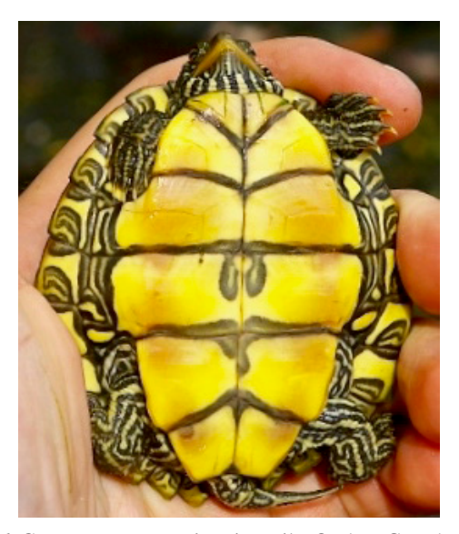
Figure 6. Graptemys geographica juvenile, Quebec, Canada.