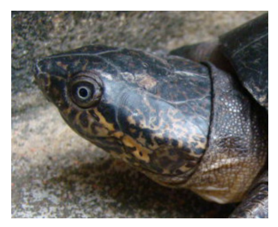
Figure 4. Subadult Pelusios niger from Itu, Nigeria.

Distribution. — Pelusios niger is endemic to the eastern coastal nations of the Gulf of Guinea, including Togo (possibly), Benin, southern Nigeria, western Cameroon, Equatorial Guinea, and western Gabon. The locality "Tschadsee" (Lake Chad) (based on ZMB 27269) cited by Fritz et al. (1993) is