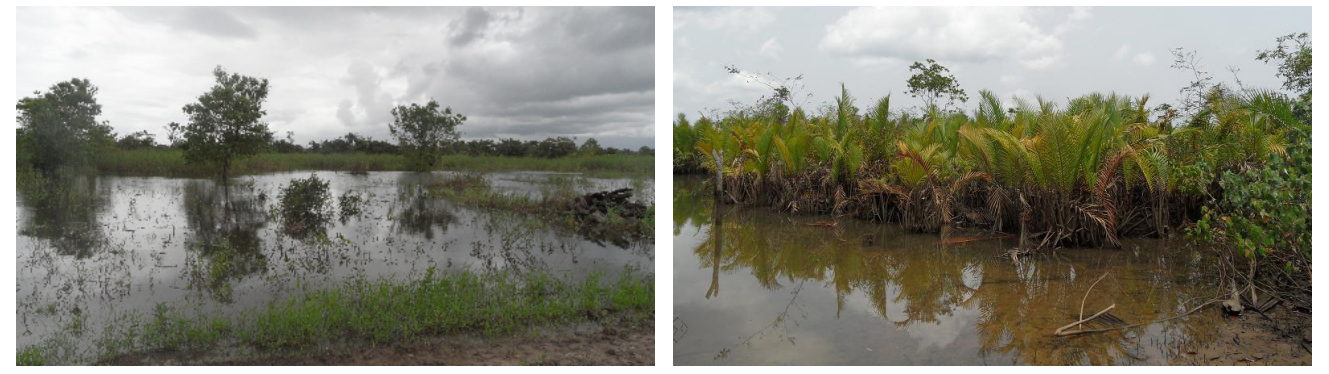
Figure 8. Riverine habitats of Pelusios niger along the Nun River course ( left ), and the Forcados River course ( right ), in the Niger Delta region of southern Nigeria.

Pelusios niger may potentially be a competitor of P. castaneus in the forest water bodies of southern Nigeria, given that they exhibit relatively similar habitat choices and dietary habits (Luiselli et al. 2004). The intensity of interspecific competition between these turtle species appears intensified in oil-polluted sites, due to a higher similarity in space use and food items (Luiselli and Akani 2003; Luiselli et al. 2004). Indeed, sophisticated statistical simulations (Monte Carlo permutations on dedicated null model algorithms)