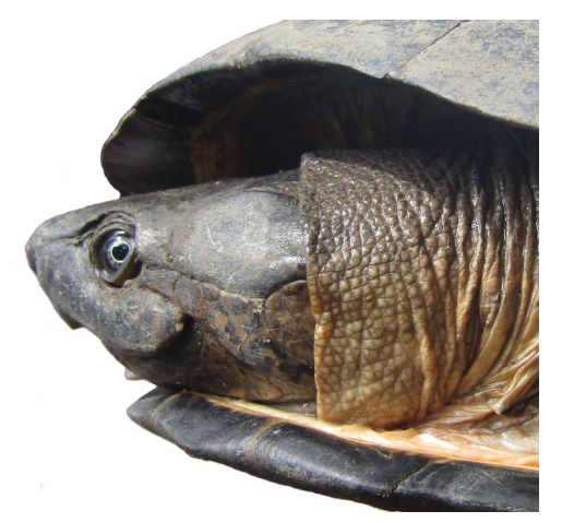
Figure 5. Large adult male Pelusios niger from Calabar, Cross River State, Nigeria.

In Nigeria, P. niger is widespread and locally very abundant in the southern regions, inside the continuous rainforest vegetation zone, where it inhabits rivers, creeks, and permanent ponds surrounded by swamp forest and gallery forest (Akani et al. 1999; Luiselli et al. 2000; Lea et al. 2003). In the Niger Delta it is still common in most of the perennial water bodies (Luiselli and Politano 1999; Akani et al. 2015a) despite heavy hunting with fishing traps (Akani et al. 2015b), and in the Cross River basin it is certainly the commonest of all turtle species (Luiselli and Politano 1999).