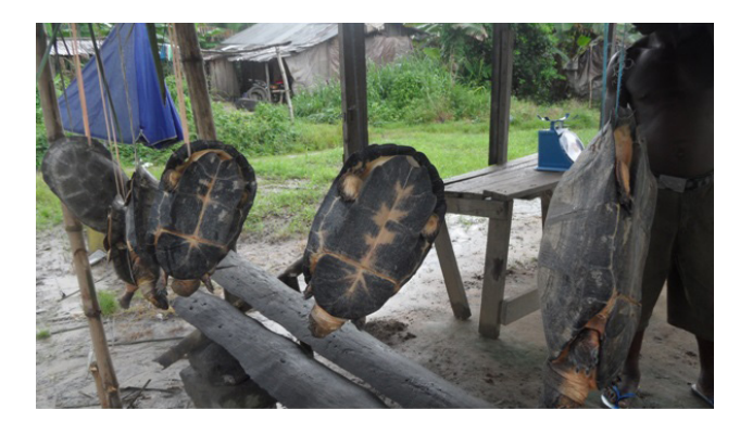
Figure 9. Specimens of Pelusios niger displayed for sale at Aven bushmeat market, Patani Local Government area, Niger Delta, Nigeria.

Locally, the species is affected by pollution and degradation of its primary habitats. In the Niger Delta of Nigeria, for instance, several populations are collapsing due to the effects of oil spill contaminations (Luiselli and Akani 2003; Luiselli et al. 2004, 2006a,b; Luiselli 2008).