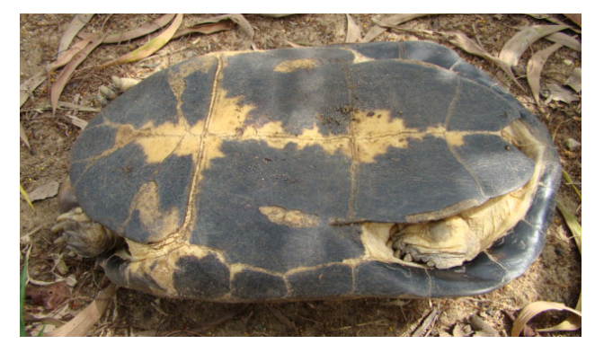
Figure 2. Adult Pelusios niger from Port Harcourt, Nigeria.

The head is wide to very wide (up to 8.4 cm wide), and pointed, and the parietal scales are either very short