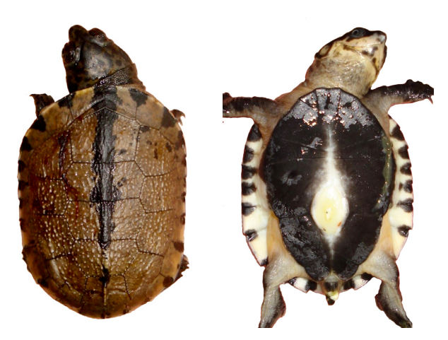
Figure 6. Hatchling Pelusios niger from nr. Lagos, Nigeria, with light carapacial coloration.