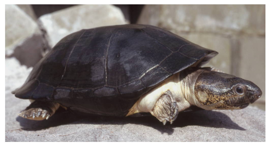
Figure 1. Pelusios niger, adult male, from Gamba, Gabon.

Description. — This is a medium-sized freshwater turtle; the carapace length (CL) of males may reach 30.0 cm, an exceptional male of 34.8 cm having increased to 35.5 cm in captivity. Females are smaller, with a greatest measured CL of 26.5 cm (Bour and Maran, 2003; Maran and Pauwels, 2005). The carapace is relatively deep, the depth being greater than half the width. The carapacial outline is wide and smoothly elliptical, with slightly elevated lateral borders. The carapace is keeled in juveniles, and persists at least on vertebrals 4 and 5 in the oldest individuals, forming tuberosities. The first marginal scutes are proportionately enlarged (wide and long), and vertebrals 2–4 become longer than wide at a CL of approximately 20 cm.