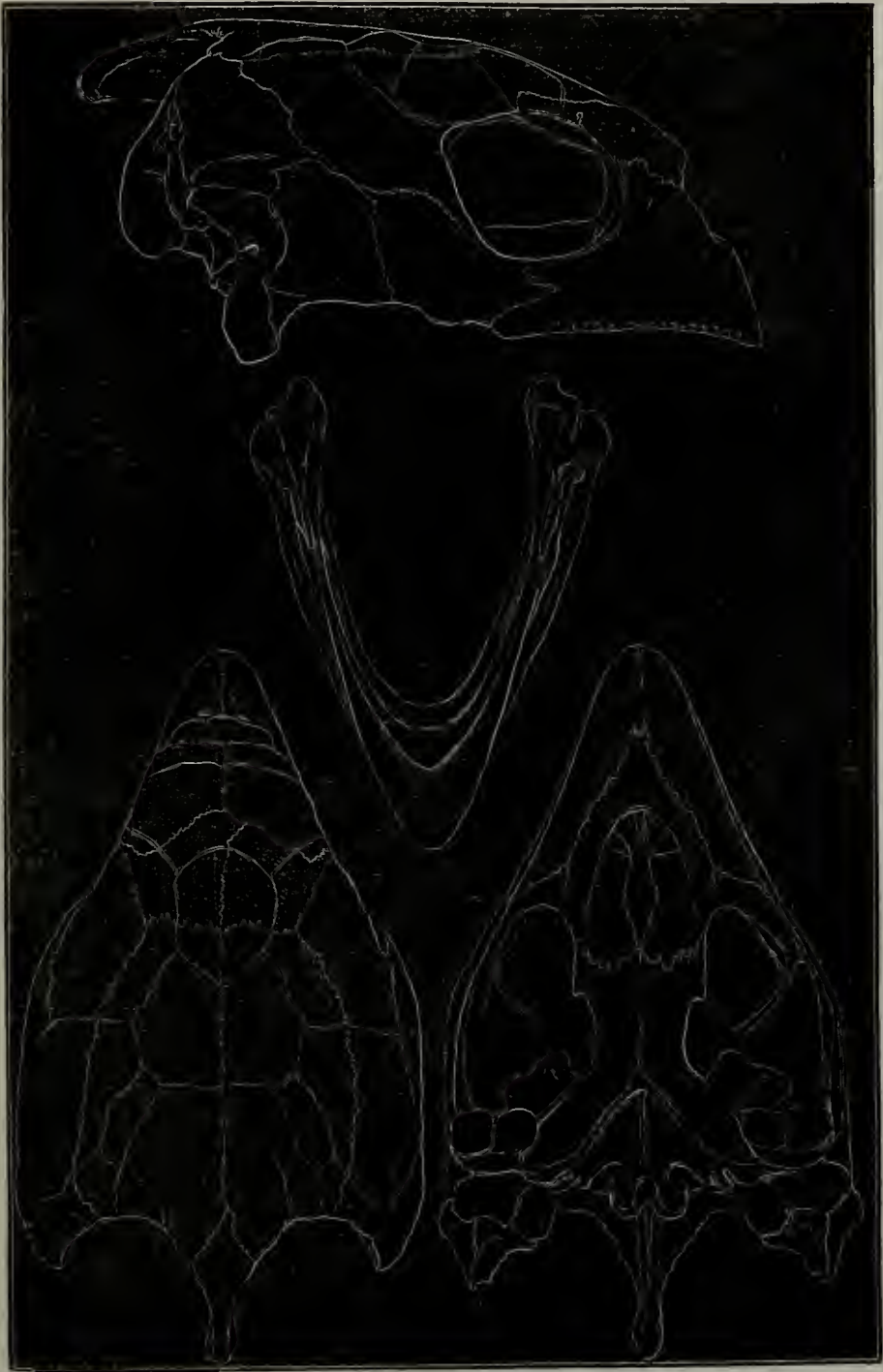
Skull of Onychochelys kraussi.